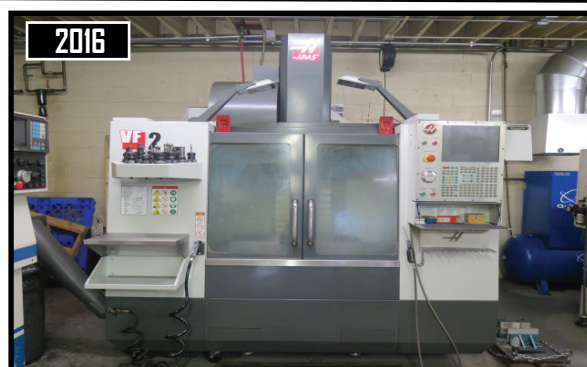
Haas VF-2 4-Axis CNC VMC w/ 24-Station Side Mount ATC, CAT-40, 8100 RPM, High Speed Machining, High Speed Tool Changer, Media Display, Rigid Tapping, 1GB Expanded Memory, Wireless Networking, Compensation Tables, Chip Auger, 3161 ON Hours, 1495 Start Hours, 1198 Cut Hours