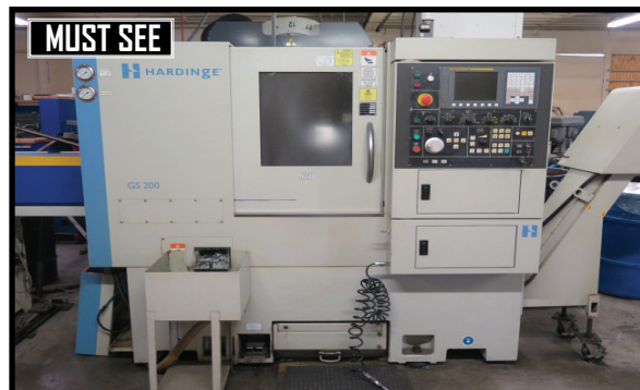
2012 Hardinge GS200 CNC Turning Center w/ Fanuc Series 0i-TD Controls, 12-Station Turret, 5000 PM, Tailstock, Parts Catcher, 8" 3-Jaw Power Chuck, S-20 Collet Pad Nose, Mist-Away Mist Collector, Chip Conveyor, (2014) Integrity SB-565 Automatic Bar Loader/Feeder s/n SB201403