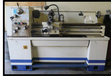
2001 Birmingham YCL-1440GH 14" x 40" Gear-Gap Lathe w/ 45-1800 RPM, Threading, Tailstock, Steady and Follow Rests, Indexing Tool Post