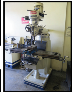
Birmingham BPS-16491 Vertical Mill w/ 3Hp Motor, 90-5600 RPM, Chrome Ways

ALL MACHINERY MOVERS MUST BE APPROVED BY THE SELLER PRIOR TO REMOVAL OF EQUIPMENT