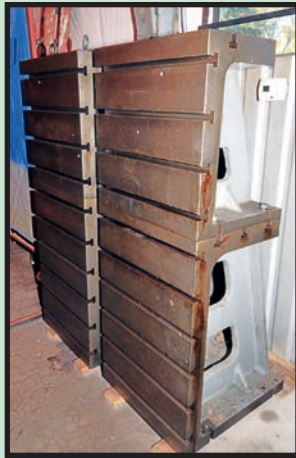
2-PIECE ANGLE PLATES