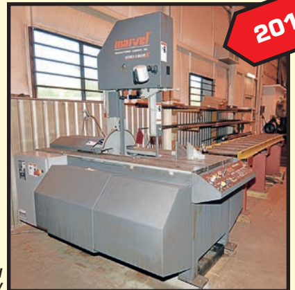
MARVEL SERIES 8 MARK III TILT FRAME VERT. BANDSAW

Read Partial Terms and Conditions on Page 5 of Brochure