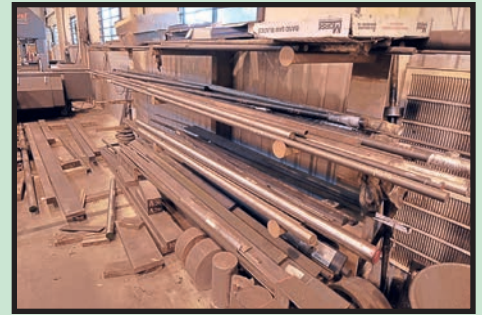
ASSORTED RAW MATERIALS