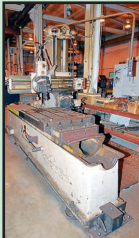
ROCKFORD HYDRAULIC PLANER