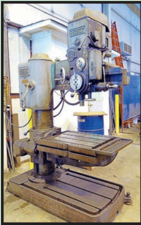
FOSDICK SENSITIVE RADIAL ARM DRILL