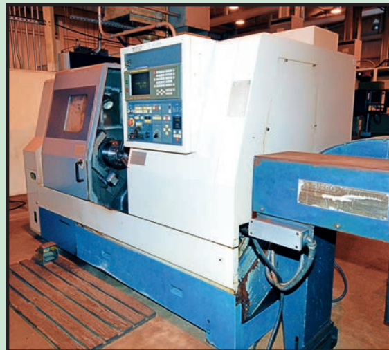
MORI SEIKI MDL. SL-25B-500 CNC LATHE