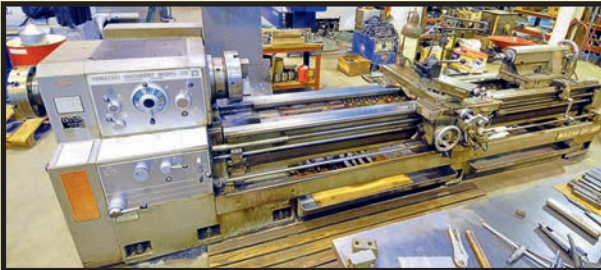
MAZAK 24" X 120" GAP BED ENGINE LATHE