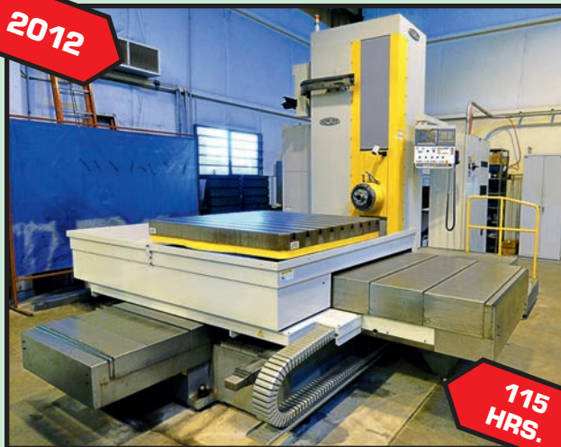
NOMURA MDL. HBA-110T-R3 CNC HORIZ. BORING MILL