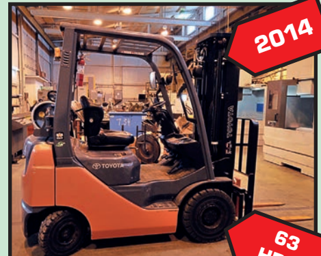
TOYOTA 2,500-LB. CAP., LPG FORKLIFT