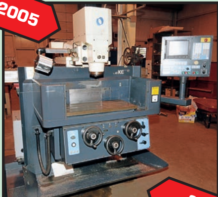
MAKINO KE-55 CNC KNEE TYPE VERT. MILLING MACHINE