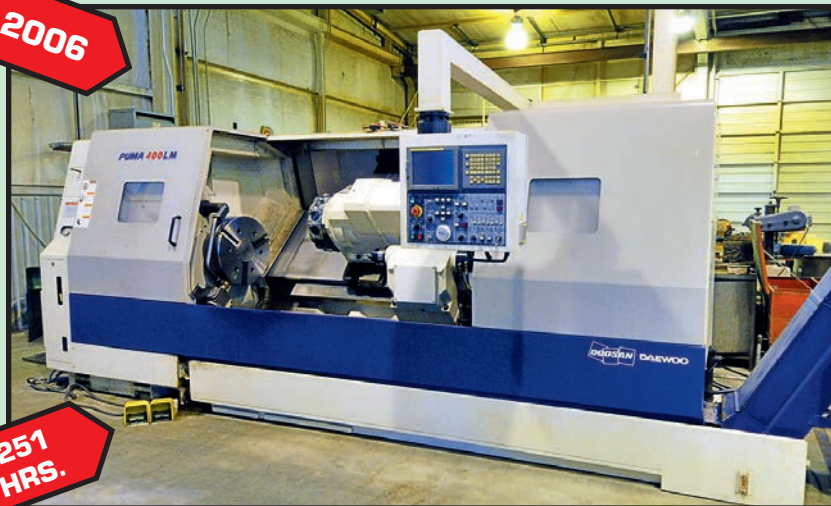
DOOSAN PUMA MDL. 400LMB CNC LATHE