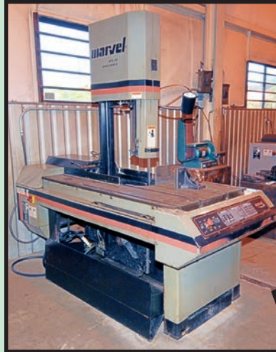
MARVEL SERIES 8 MARK II TILT FRAME VERT. BANDSAW