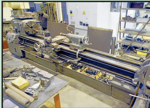
MONARCH 24" X 132" ENGINE LATHE