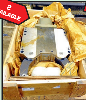
SCHUNK 3-PT. HYDRAULIC STEADYREST FOR DOOSAN PUMA 400