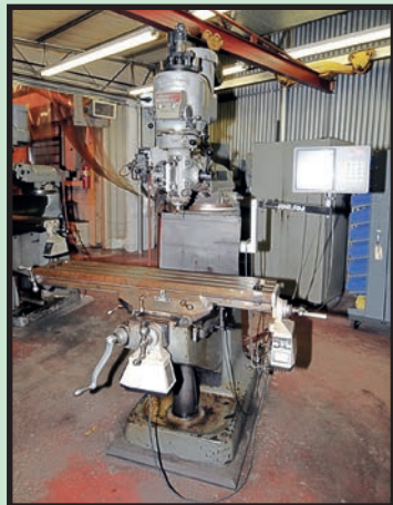
BRIDGEPORT SERIES II SPECIAL VERT. TURRET MILLING MACHINE

ELECTRO ARC MDL. 2SVQT , new 2013, 15 KVA, 440 v., Mdl. Q disintegrator head, auto. feed, assorted mandrels, portable base, S/N 15007.