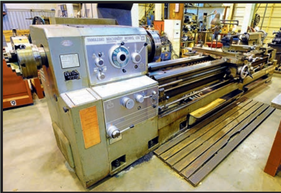
MAZAK 24" X 120" GAP BED ENGINE LATHE

INGERSOLL RAND AIR COMPRESSOR , 15 HP motor, 80 gal. horiz. tank, tank mtd.