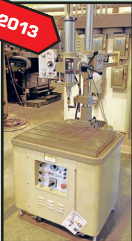
ELECTRO ARC TAP DISINTEGRATOR