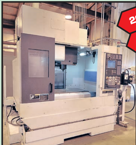
MORI SEIKI MDL. NV-5000-A1B/40 4-AXIS VERT. MACHINING CENTER