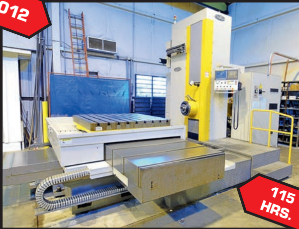
NOMURA MDL. HBA-110T-R3 CNC HORIZ. BORING MILL