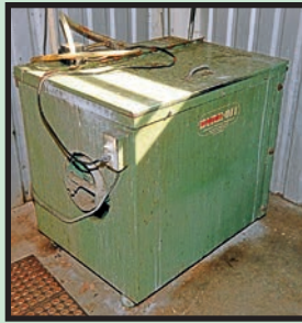
BURR-OFF VIBRATORY FINISHER