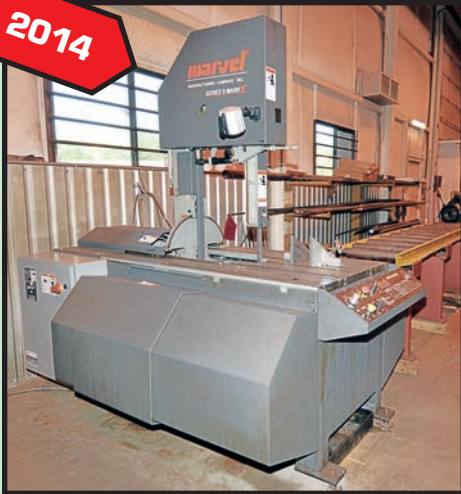
MARVEL SERIES 8 MARK III TILT FRAME VERT. BANDSAW