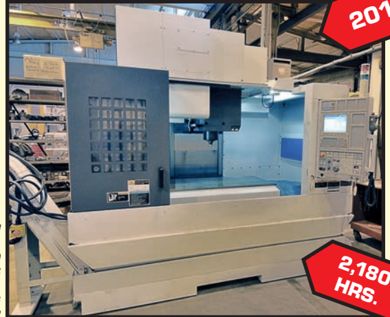
MORI SEIKI MDL. NV-5000-A2/40 4-AXIS VERT. MACHINING CENTER