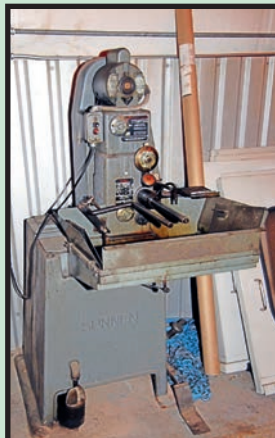
SUNNEN HONING MACHINE