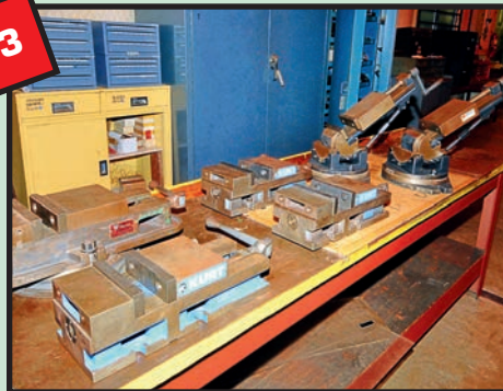
ASSORTED MILLING VISES