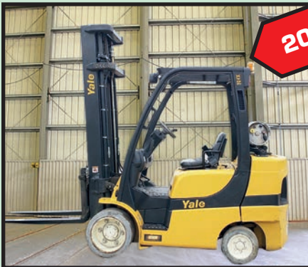
1 OF 2) YAL E 7,000-LB. BASE CAP. MDL. GLC070

TOYOTA 2,500-LB. CAP. MDL. 8FGU15, new 2014, LPG pwr., 2,500-lb. cap. @ 24" L.C., 189" max. lift, side shift, large dia. cushion tires, 63.2 H.O.M., S/N 60343.