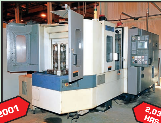
MORI SEIKI MDL. SH-403 4-AXIS HORIZ. MACHINING CENTER