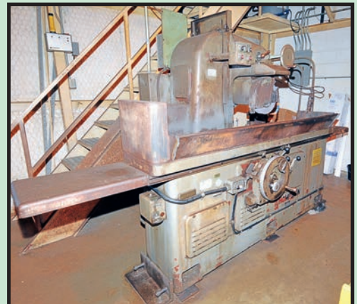
THOMPSON HYDRAULIC SURFACE GRINDER