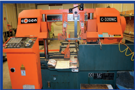
Cosen C-320NC Saw, Model C-320NC