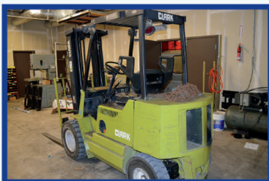
Clark Forklift, 4000lbs Capacity Model GPX25 Type G