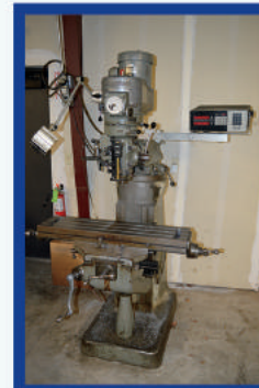
Bridgeport Knee Mill