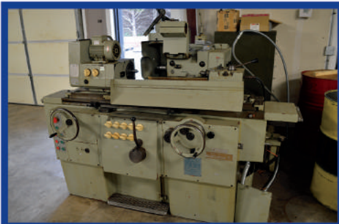
TOS BHU25 Cylindrical Grinder