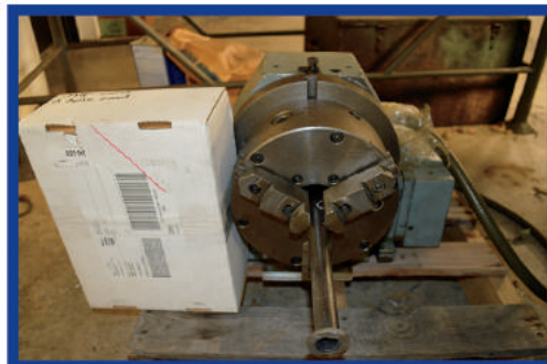
Troyke 4th Axis w/ Amp Card