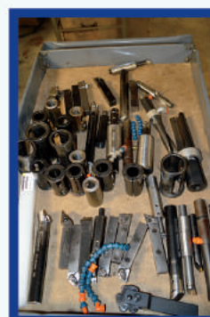
Rolling Cart w/ Contents

If You Want to Sell Your Shop or Business Assets or Know Someone Who Does? Call Us @ (480) 455-3910 | We Pay Great Finder's Fees!