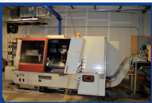
Okuma & Howa Act 5L