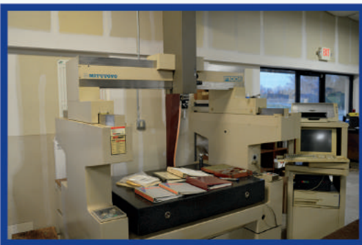
Mitutoyo F-1006 CMM