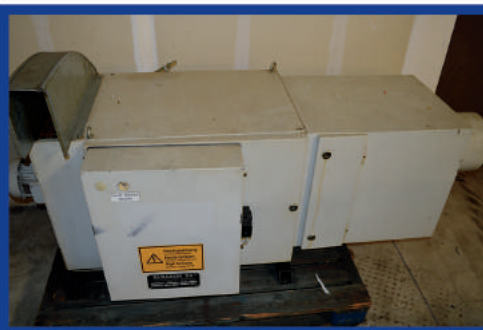
Mist Buster System