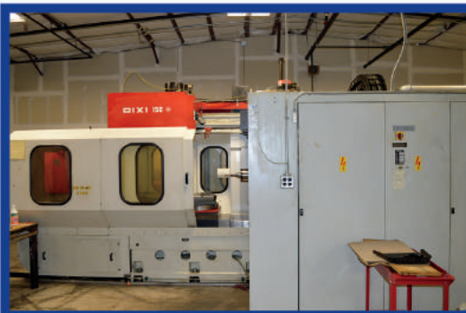
Wahli Dixie 150 5 Axis Horizontal