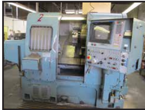
Mori Seiki SL-3H CNC Lathe, with 10" Chuck, 12 Station Turret, Fanuc 10TE-F control, s/n 4452.