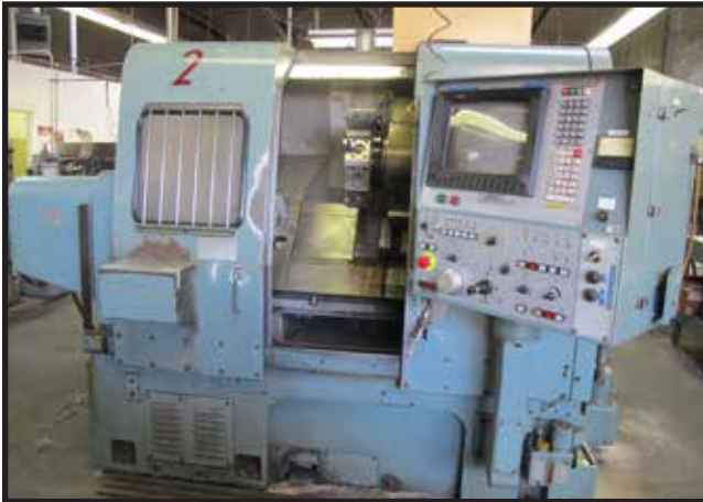
Mori Seiki SL-3H CNC Lathe, with 10” Chuck, 12 Station Turret, Fanuc 10TE-F control, s/n 4452.