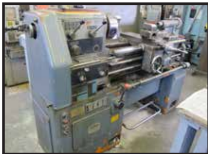
Webb Takisawa TSL-800D Engine Lathe.

TERMS OF SALE: CASH OR CASHIER'S CHECK ONLY. 15% BUYERS PREMIUM ON ALL PURCHASES. $200.00 REFUNDABLE CASH DEPOSIT. 2% CASH DEPOSIT TOWARDS ALL PURCHASES. ALL SALES ARE SUBJECT TO CALIFORNIA SALES TAX. THERE WILL BE NO EXCEPTIONS.