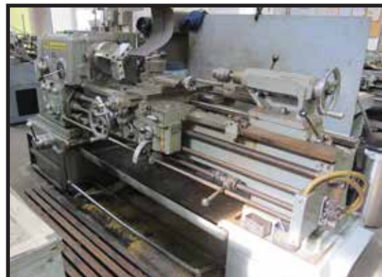
H.E.S. HN-400 Engine lathe with threading, tracer, s/n 13907.