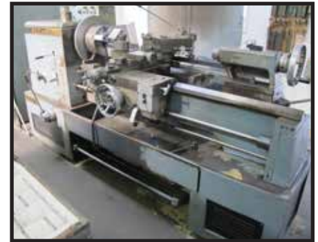
H.E.S. C-450, 18" Engine Lathe with Tracer, taper attachment, s/n 2862.