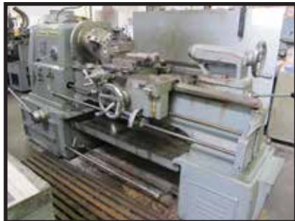
H.E.S. C450 Engine lathe with tracer, taper and threading.