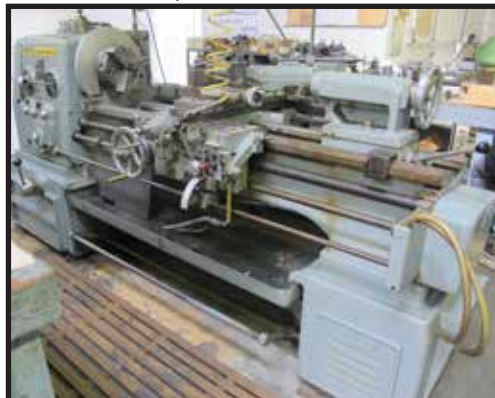
H.E.S. HN-400 Engine Lathe with threading, s/n 13946.