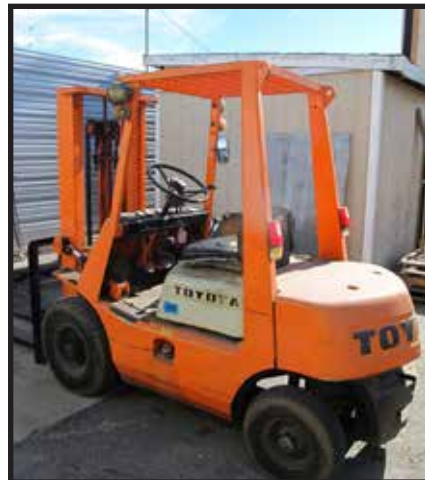
Toyota 2000 LB Forklift with pneumatic tires, 2 stage.