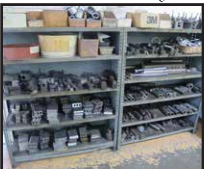
Large selection of tooling and support.