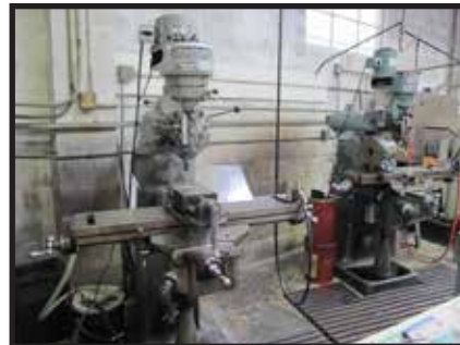
Bridgeport Vertical milling machines.