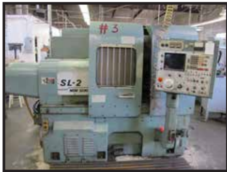
Mori Seiki SL-2B CNC Lathe, w/ Fanuc 6T control, 12 Station Turret, 10" Chuck, s/n 383.