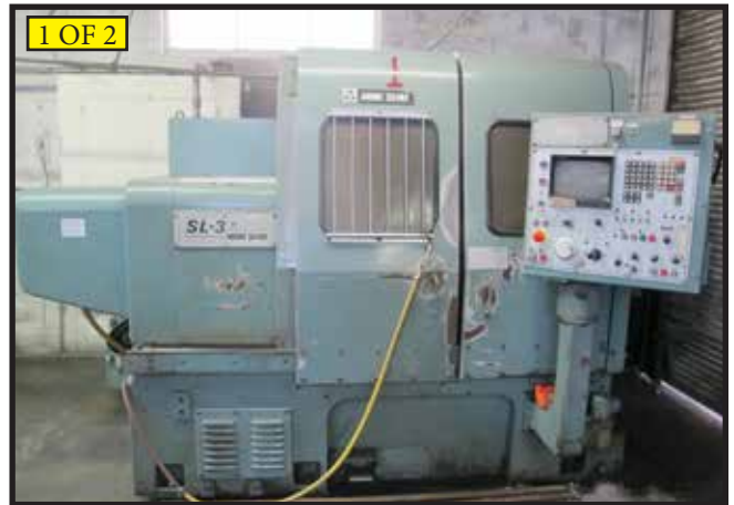
(1 of 2) Mori Seiki SL-3H CNC Lathe with Fanuc Control, 10” Chuck, 12 Position Turret.