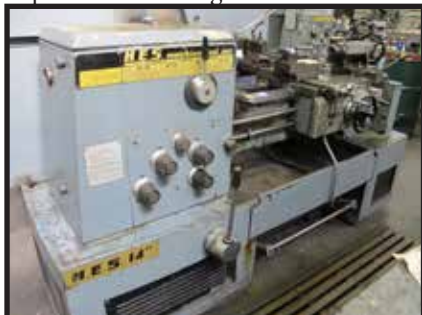
H.E.S. J-350 14" Engine lathe with taper attachment, threading, s/n 1545.