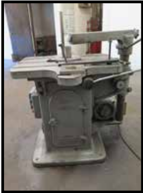
Davis No.5 Mechanical Broaching Machine