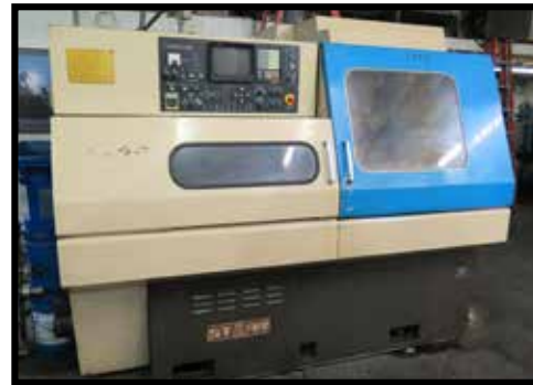
Star VNC-32 Twin Spindle - Twin Turret Multi-Axis CNC Screw Machine s/n 016102 w/ Fanuc Series 10-T Controls, (2) 6-Station Live Turrets, Live Turret Tooling, Hydraulic Bar Feed, Coolant

Hardinge mdl. HC Hand Chucker s/n HC-6832-T w/ 125-3000 RPM, 8-Station Turret, Power Feeds, 5C Collet Closer, Cut-Off Attachment and Tooling.