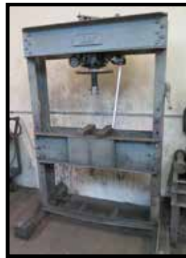
Acco Press 70-Ton Sliding Ram Hydraulic H-Frame Press