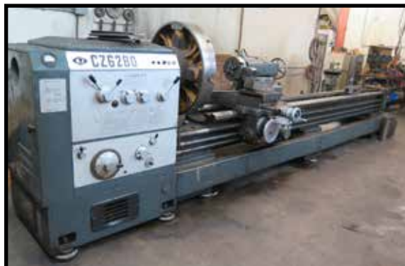
Zhen Jiang mdl. CZ6280 32" x 156" Geared Head Gap Bed Lathe s/n 96104 w/ 16-900 RPM, 1000mm Swing Over Gap, 4000mm Between Centers, Inch/mm Threading, Tailstock, 10" 4-Jaw Tailstock Chuck, Steady and Follow Rests, KDK Tool Post, 31 1/2" 4-Jaw and 20" 4-Jaw Chucks, 31 1/2" Faceplate