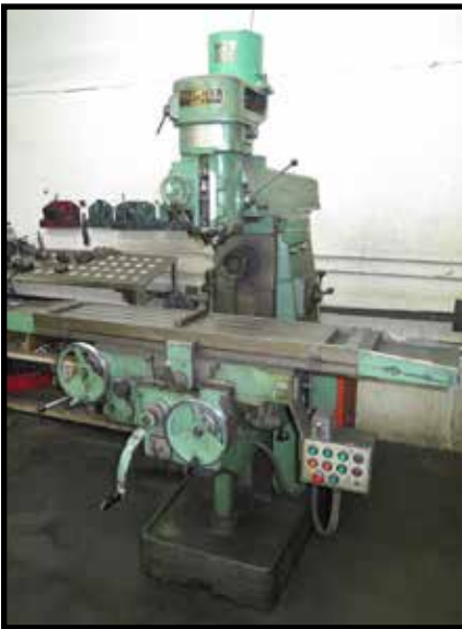
MaxMill mdl. YC-2G Mark-II Universal Power Mill s/n 03498 w/ NTMB-40 Vertical and Horizontal Spindles, 75-3600 Vertical RPM, 85-1300 Horizontal RPM, Power Feeds, 11" x 51" Table