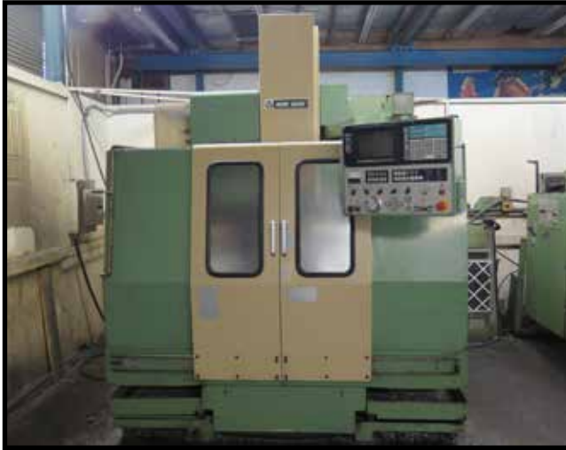
Mori Seiki MV-JUNIOR CNC Vertical Machining Center s/n 3273 w/ Yasnac Controls, 20-Station ATC, CAT-40 Taper Spindle, 17 3/4" x 35 1/2" Table, Coolant