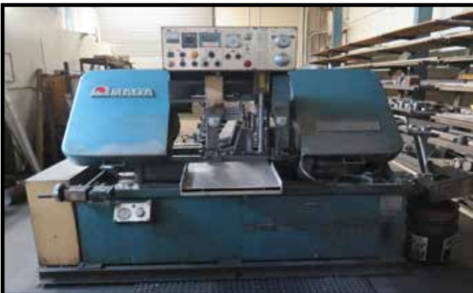
Amada HA-400 16" Automatic Hydraulic Horizontal Band Saw s/n 40300059 w/ Amada Controls, Auto Clamping and Feeds, Bundling, Chip Auger, Coolant, Conveyors