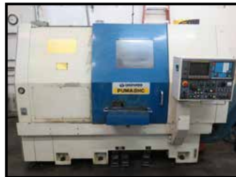
Daewoo PUMA 8HC CNC Turning Center s/n 560093 w/ Fanuc Series 0-T Controls, 12-Station Turret, Hydraulic Tailstock, 8" 3-Jaw Power Chuck, S-20 Collet Pad Nose, Chip Conveyor, Coolant