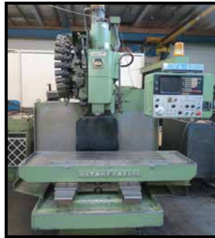
Hitachi Seiki VA-40 CNC Vertical Machining Center s/n NA w/ Fancu Series 6-M Controls, 25-Station ATC, CAT-40 Taper Spindle, 15 1/2" x 49" Table, Coolant