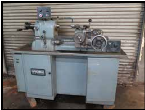
Hardinge mdl. HC Hand Chucker s/n HC-6832-T w/ 125-3000 RPM, 8-Station Turret, Power Feeds, 5C Collet Closer, Cut-Off Attachment and Tooling

Clark mdl. EC70SSC 6000 Lb Cap Electric Forklift s/n EC60SG-80-2004 w/ 2-Stage Mast, 180" Lift Height, Charger. Forklift Safety Cage. 1976 Chevrolet Scotsdale-20 4X4 Stake Bed Truck VIN# CKL246F491540. Crane-Veyor 1/2 Ton Cap. 6-Post Free Standing Gantry Crane w/ Electric Hoist, Approx 23' x 42' @ Posts. Gorbel 1/2 Ton Wall Mounted Jib w/ CM Electric Hoist. 1-Ton Cap Wall-Mounted Jib w/ Acco 1/2 Ton Electric Hoist. 1/2 Ton Wall Mounted Jib w/ Coffing Electric Hoist. 1/2 Ton Cap Wall Mounted Jib w/ Electric Hoist. Spanco 1/4 Ton Cap Floor Mounted Jib w/ Electric Hoist. Spanco 1/4 Ton Cap Floor Mounted Jib (NO HOIST). Misc Raw Materials Including Aluminum, Stainless and Cold Rolled Bar Stock. Material Racks. Flammables Storage Cabinet. Portable Swamp Coolers.