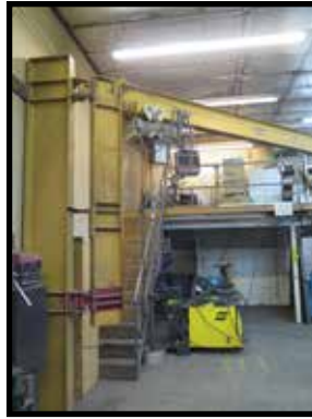
1/2 Ton Wall Mounted Jib w/ Coffing Electric Hoist