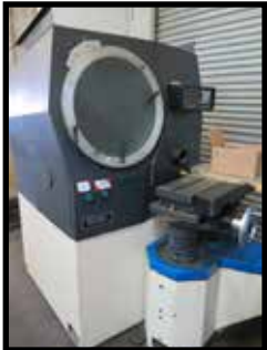
Jones & Lamson 20" Optical Comparator s/n C-509009 w/ J & L Decimetric II DRO