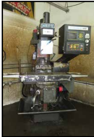
Webb mdl. 5BVK CNC Vertical Mill s/n 782087 w/ Webbmatic 800 Controls, Fancu Series 0-M Controls, NTMB-40 Taper Spindle, 75-3800 Dial Change RPM, 13" x 42" Table