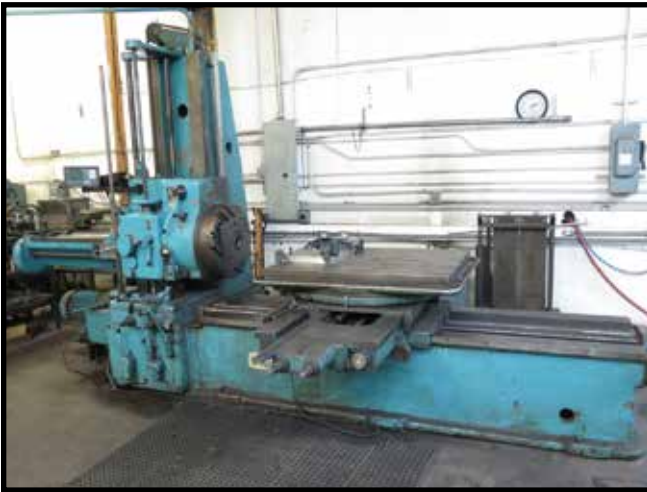
Union BF-80 Horizontal Boring Mill s/n 21031/61 w/ Newall DRO, 2.8-1000 RPM, Power Feeds, 19" Boring Spindle Chuck, 35 3/4" x 44 1/2" Indexing Table @ 1 Deg, Arbor Tailstock, Arbors