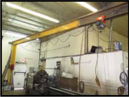
1/2 Ton Cap Wall Mounted Jib w/ Electric Hoist