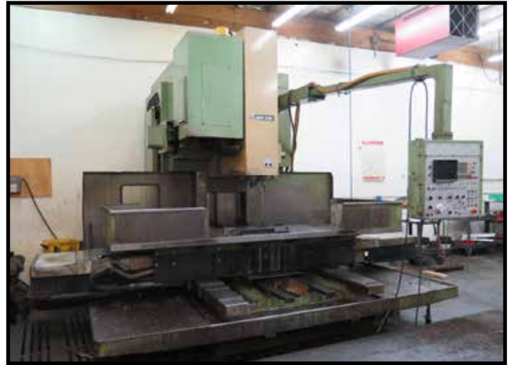
Mori Seiki MV-50W CNC Vertical Machining Centers 3 w/ Fanuc System 6-M Controls, 32-Station ATC, CAT-50 Taper Spindle, 31" x 62" Table, Coolant