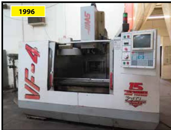
1996 1996 Haas VF-4 4-Axis CNC Vertical Machining Center s/n 8017 w/ Haas Controls, 20-Station ATC, CAT-40 Taper Spindle, 7500 RPM, Thru Spindle Coolant, 15Hp High Torque Motor, Rigid Tapping, Programmable Coolant Nozzle, Floppy Disc, 18" x 52" Table, Coolant