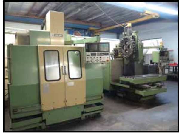
"CNC Milling Department"