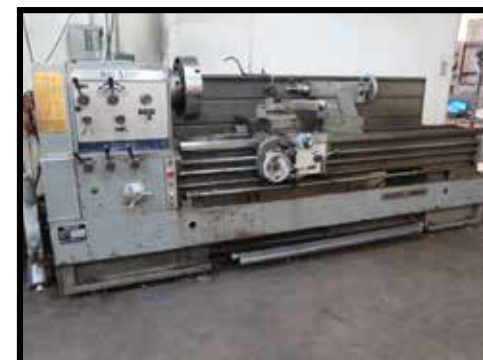
Sharp mdl. 2680 26" x 80" Geared Head Gap Bed Lathe s/n 6712009 w/ 15-1000 RPM, Inch/mm Threading, Taper Attachment, Tailstock, Steady Rest, KDK Tool Post, 18" 4-Jaw and 16" 4-Jaw Chucks