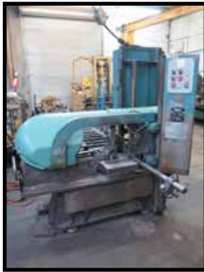
Wells mdl. 1270 12" Horizontal Band Saw s/n 1775 w/ Manual Clamping, Coolant, Conveyor