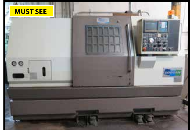
MUST SEE 1997 Doosan Dooturn-4 CNC Turning Center s/n LND0092 w/ Fanuc Series 0-T Controls, 12-Station Turret, Hydraulic Tailstock, 15" 3-Jaw Power Chuck, 2-J Power Chuck, Chip Conveyor, Coolant