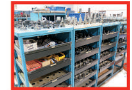
Over 100 Lots of tooling and workholding

This brochure is only a partial listing. Please visit our website and bid online @ www.kdauctions.com