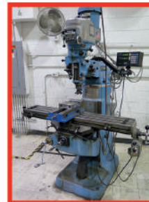
Bridgeport Vertical Mill