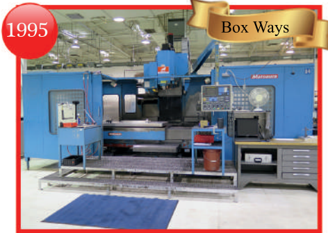
1995 Matsuura MC-2000V , VMC, 50 Taper Attention: Plant Manager or Equipment Buyer