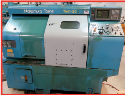
Nakamura-Tome TMC-20 II CNC Lathe