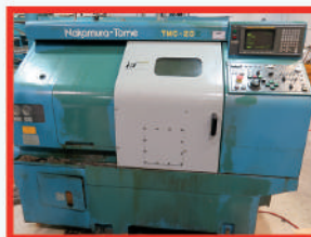
Nakamura-Tome TMC-20 II CNC Lathe