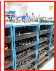
Over 100 Lots of tooling & workholding