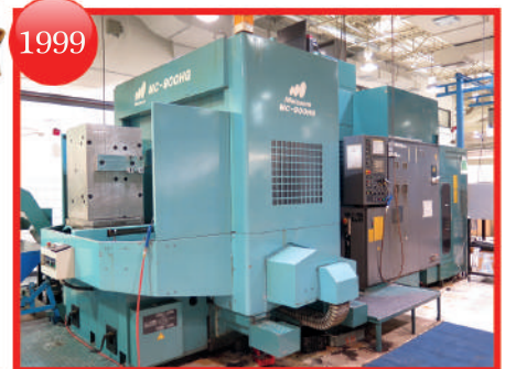
1999 Matsuura MC-900HG 2-Pallet 4-Axis