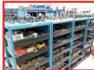
Over 100 Lots of tooling & workholding