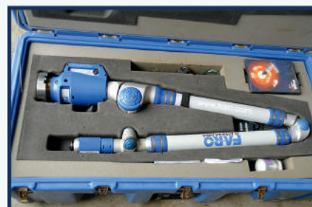
Faro Arm Model P08, 22.6 Revision Cert 2 Sigma Single Point Accuracy 0.030mm