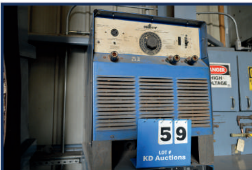
Miller Arc Welder, Model SRH-444, SN HG0200389