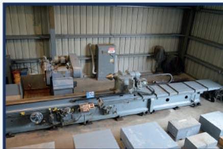
Norton Grinder D-15684 with Acu-Rite DRO Control