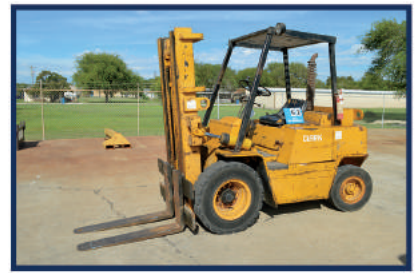
Clark Forklift, 4' Forks, 7000LB Capacity, C-500y60 Type D, Colum Shift, Gas Powered

Attention: Plant Manager or Equipment Buyer