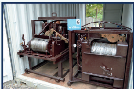
Wire Line Units and Accessories

Auction Starts: Thursday, Dec. 15, 2016 10:00 am (CST) Inspection/Preview: Wednesday, Dec. 14, 2016 8:00 am - 12:00 pm Location: Ingleside, TX