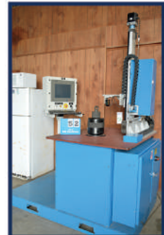
Drill Bit Measurement Machine, Built By Arc Specialties