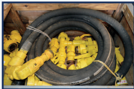
Wire Line Pump Down Assembly with Hoses