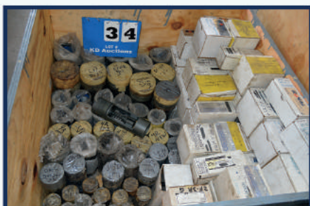
Assorted Drill Pipe Float Valves and Repair Kits