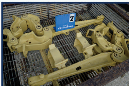
Magic Industries 25,000 LB Make Up/Break Out Tong Torque Gage