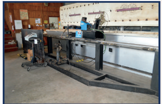
Cylindrical Track Mig Welder with Miller Invision 456MP DC Inverter Arc Welder