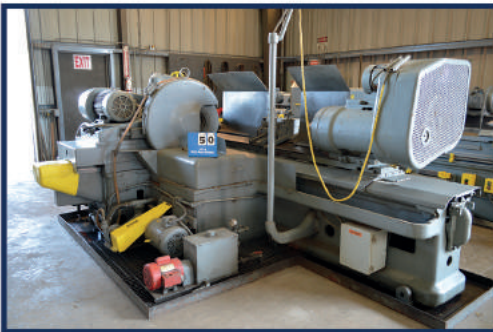
Norton Cylindrical Grinder, 3" Grinding Wheel, Live Centers

This brochure is only a partial listing. Please visit our website and bid online @ www.kdauctions.com