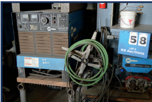
Miller Deltaweld 451 Constant Voltage DC Arc Welder with Miller S-54E Wire Feeder