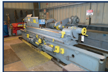
Norton Hydraulic Mechanical Cylindrical Grinder, 2" Grinding Wheel

If You Want to Sell Your Shop or Business Assets or Know Someone Who Does? Call Us @ (480) 455-3910 | We Pay Great Finder's Fees!