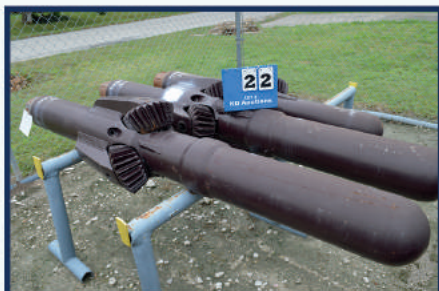
Hole Openers, Assorted Sizes with Extra Cutters