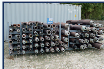
Double Bladed Fat-Pak® Near Bit Stabilizers