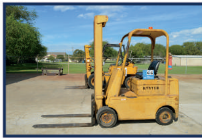
Hyster Forklift, 4' Forks, 3000LB Capacity, Gas Powered

5 Axis Mazak Facility (Onsite/Online), Location: California —MORE INFORMATION COMING SOON—