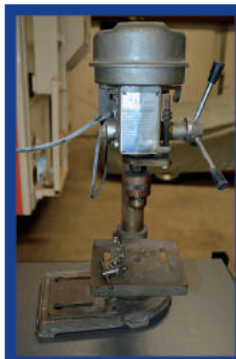
CTT 13M Small Bench Mill