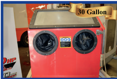
Central Pneumatic Sand Blast Cabinet