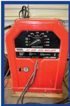
Lincoln Electric AC-225 Welder