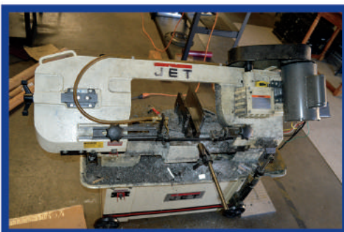
Jet Band Saw Model HVBS-&MW, 7"