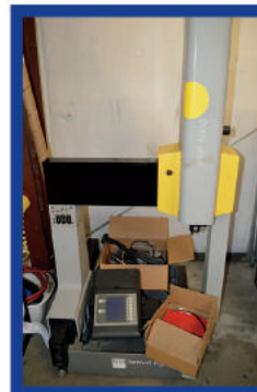
Brown & Sharpe Gage 20