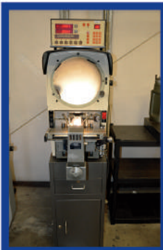
Gage Master Series 20