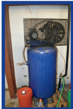
2010 Weg Air Compressor

This brochure is only a partial listing. Please visit our website and bid online @ www.kdauctions.com