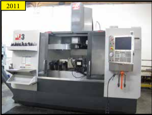
2011 HAAS VF3 CNC VMC, 5 AXIS READY, CT 40, 20 ATC, 40" X 20" X 25" (XYZ), CHIP AUGER, S/N 1085122.