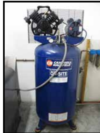
CAMPBELL 5HP VERTICAL AIR COMPRESSOR.