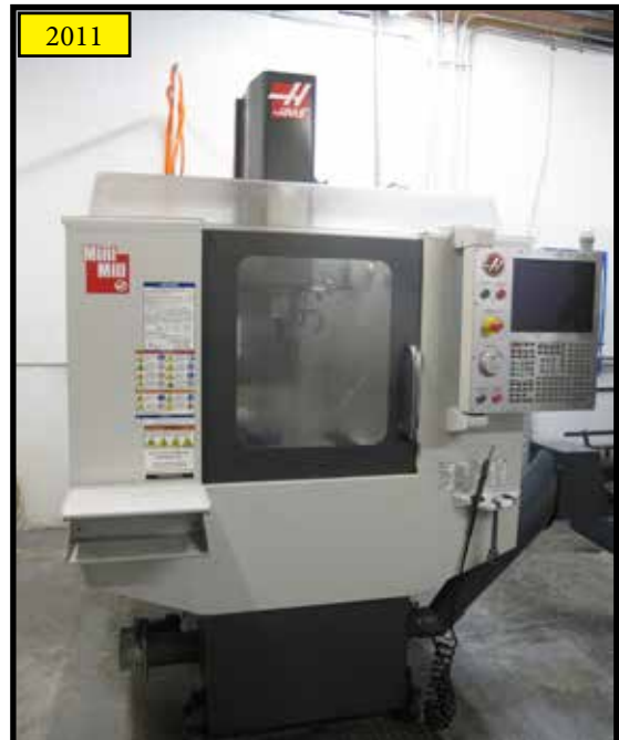
2011 HAAS CNC MINI MILL, CT-40, 10 ATC, 16" X 12" X 10" (XYZ), CHIP AUGER, S/N 1084616.