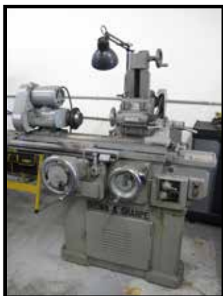
BROWN AND SHARPE NO. 13 UNIVERSAL OD AND TOOL CUTTER GRINDER.

LARGE SELECTION OF INSPECTION TOOLS AND SUPPORT.