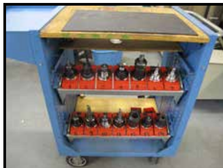
CT-40 TOOL HOLDERS AND RACK.

Directions : From Downtown L.A., take I-5 North to CA-118 West and exit Topanga Canyon Blvd, Turn Left onto Topanga Canyon Blvd, then turn left onto Lassen Street and turn right onto Owensmouth Avenue.