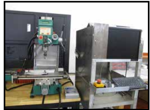
GRIZZLY CNC DELUXE MINI TABLE TOP MILL, MOEL G0619.