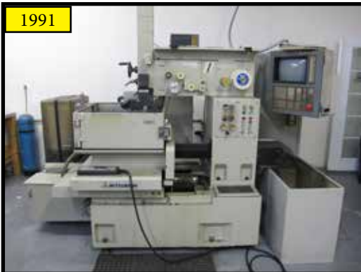
1991 MITSUBISHI DWC-90SB CNC WIRE EDM, DRO, 17.7" X 13.7" X 6.6" (XYZ), S/N 019SB205.