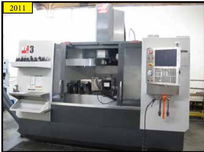
2011 HAAS VF3 CNC VMC, 5 AXIS READY, CT 40, 20 ATC, 40" X 20" X 25" (XYZ), CHIP AUGER, S/N 1085122.