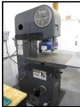
DO ALL VERTICAL BAND SAW.