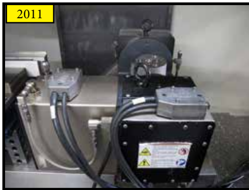
2011 HAAS PR160Y 5TH AXIS TRUNION TABLE, 6" CHUCK, S/N 903986.