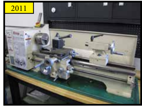
2011 GRIZZLY LATHE MODEL G99722, TABLE TOP, 150 TO 2400 RPM, S/N 2011480.