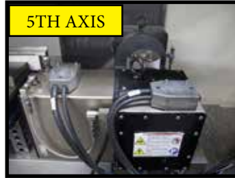
2011 HAAS PR160Y 5TH AXIS TRUNION TABLE, 6" CHUCK, S/N 903986.