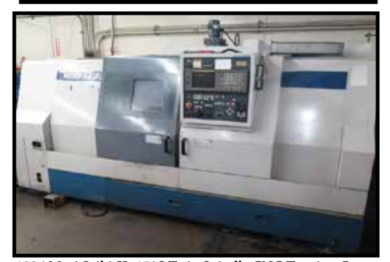
1996 Mori Seiki SL-150S Twin Spindle CNC Turning Center w/ MSC-518 Controls, Tool Presetter,12-Station Turret, 5000 RPM on Main and Sub-Spindles