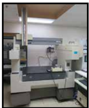
Mitutoyo FN905 CMM Machine w/ Renishaw PH9 Probe and Drive Controller, Joystick Axial Controller, miCAT MCOSMOS 3.5.4 R2 Software