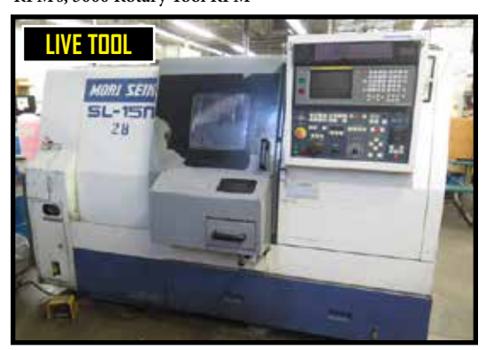
Mori Seiki SL-15MC Live Turret CNC Turning Center w/ Fanuc MF-T6 Controls, Tool Presetter, 12-Station Turret with 6-Live Stations, 5000 Spindle RPM, 2000 Rotary Tool RPM