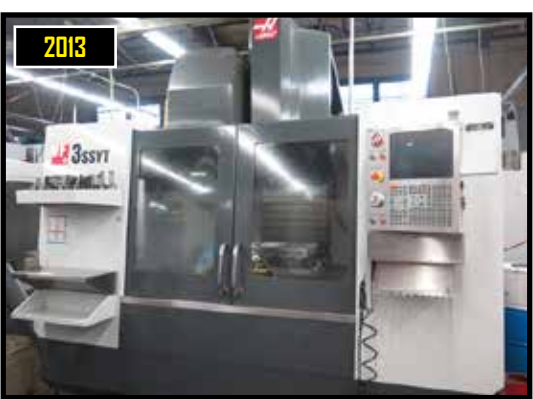
2013 Haas VF-3SSYT CNC VMC w/ 40-Station Side Mount ATC, BT-40, 12,000 RPM, Renishaw Probing System, Rigid Tapping