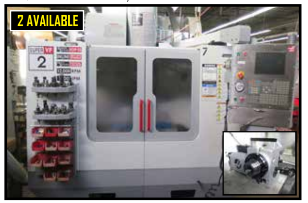
2005 Haas VF-2SS 4-Axis CNC VMC w/ 24-Side Mount ATS, BT-40, 12,000 RPM, Renishaw Probe System ***2-AVAILABLE***