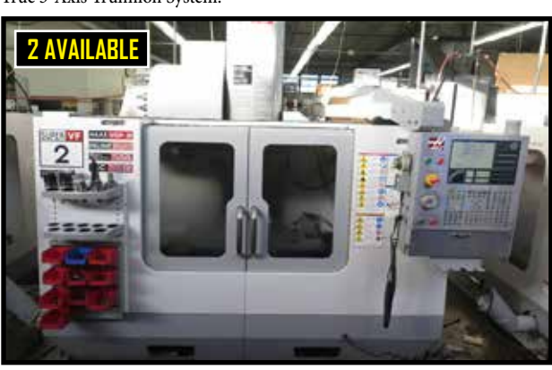
2007 Haas VF-2SSYT 4-Axis CNC VMC w/24-Side Mount ATC, BT-40, 12,000 RPM, Renishaw Wireless Probing System