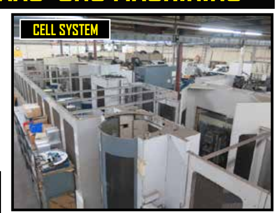
Mori Seiki Pallet Cell w/ 2000 Mori Seiki SH-503/40 Multi-Pallet HMC, (2) Mori Seiki SH-50 Multi-Pallet HMC's, 18-Station Linear Pallet Pool, Fanuc PowerMate Machine Interface System