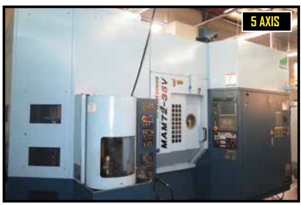
2008 Matsuura MAM 72-35V 5-Axis Multi Pallet CNC VMC w/ Matsuura G-Tech 30i Controls, 32-Station Tower Pallet Chuck System, 240-Station ATC, BT-40, 20,000 RPM, True 5-Axis Trunnion System.