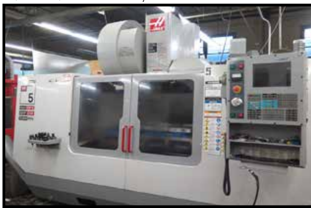
2004 Haas VF-5D/40 4-Axis CNC VMC w/ 40-Station Side Mount ATC, BT-40, 10,000 RPM, Renishaw Probing System, Rigid Tapping