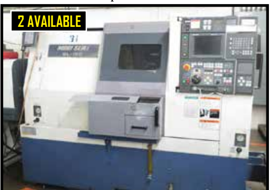
1999 Mori Seiki SL-150SMC Twin Spindle – Live Turret CNC Turning Center w/ MSC-501 Controls,Tool Presetter, 12-Station Live Turret, 40-5000 Main and Sub Spindle RPM's, 3000 Rotary Tool RPM