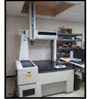
Mitutoyo Bright-A707 "Bright APEX" CMM Machine w/ Renishaw PH9 Probe and Drive Controller, Joystick Axial Controller, miCAT MCOSMOS 3.5.4 R2 Software