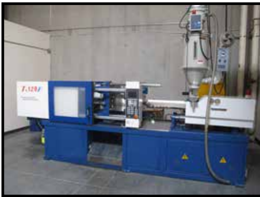
PLASTIC INJECTION MOLDER MODEL TX128F, 128 TON, TECHMATION CNC CONTROLS, RDM HOPPER DRYER, RAL VACUUM LOADER.