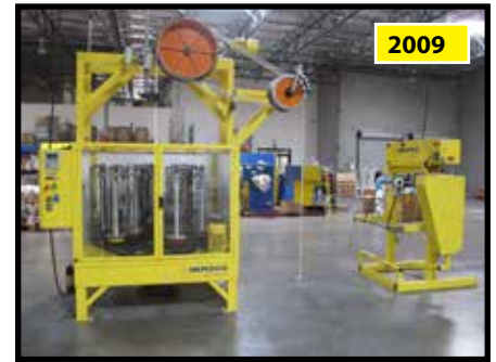
2009 HERZOG SE 1/12 - 432 ROPE BAIDING MACHINES, 12 CARRIERS, W/SIEMENS CONTROL, AND AW 1250 PM AUTO WINDER