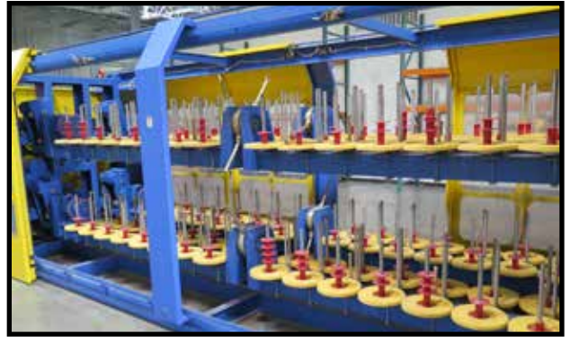
2009 MAHESH MODEL MTP20-4128 ELECTRONIC ROPE MAKING MACHINE, 128 BOBBINS SPOOLS, DIG COUNTER, COIL WINDER, AND CHEESE WINDER