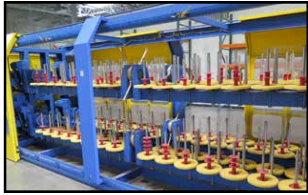
2009 MAHESH MODEL MTP20-4128 ELECTRONIC ROPE MAKING MACHINE, 128 BOBBINS SPOOLS, DIG COUNTER, COIL WINDER, AND CHEESE WINDER