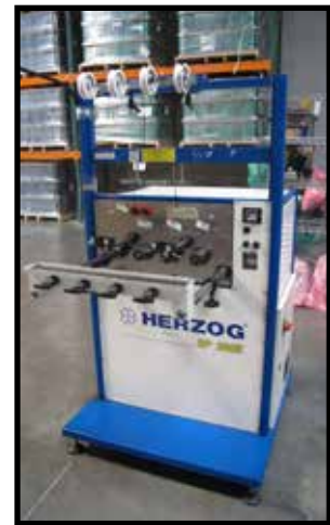
2009 HERZOG TYPE SP280E 4 SPOOL TWISTING MACHINE, S/N 112338