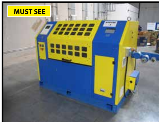
2009 MAHESH TWISTO TECH MODEL MTP/IE-100 IN FLOW ROPE MAKER W/DIGITAL CONTROL.