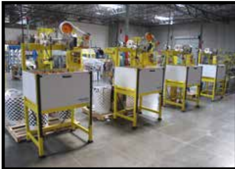
(4) 2009 HERZOG TYPE NG-1/16-140 ROUND BRAIDING MACHINES WW/16 CARRIERS TENSIONER, BOBBIN 78X280 mm=121cc