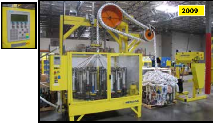
2009 HERZOG SE 1/24 - 336 ROPE BAIDING MACHINES, 24 CARRIERS, W/SIEMENS CONTROL, S/N:11228 W/1250 PM AUTO WINDER