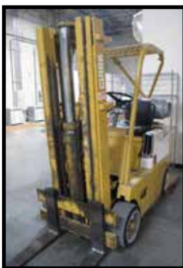
CLARK CF40B, 4000LB LPG FORKLIFT, 3 STAGE