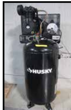
HUSKY 5 HP VERTICAL AIR COMPRESSOR