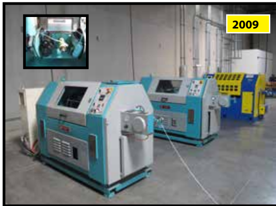
4) SIMA MODEL T2TR99 ROPE TWISTING MACHINE WITH WEIGHTED TENSIONERS.