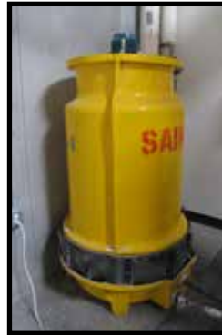
SAINT COOLING TOWER