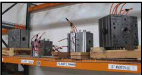
MOLDS FOR PLASTIC INJECTION