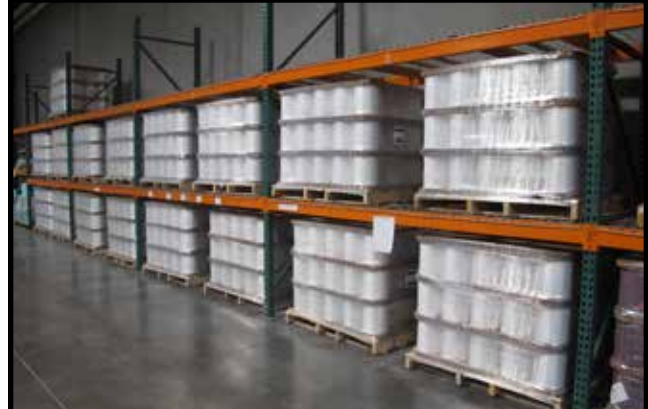
APPOX 60 PALLETS OF FIRESTONE N6 MULTI FILAMENT YARN IN VARIOUS COLORS (136-204 FILAMENTS)