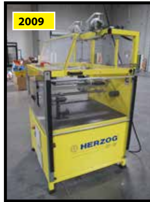
2009 HERZOG TYPE SP-05 2 SPINDLE MAUAL WINDING/ASSEMBLING METER COUNTER MACHINE, S/N: 112220