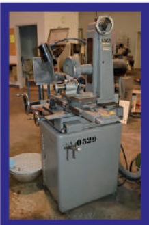
Boyar Schultz Electric Surface Grinder with Dust Collector & Cutting and Grinding Wheels