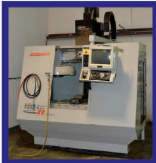
Bridgeport Discovery Torq-Cut 22 ATC, 6" Kurt Vise

This brochure is only a partial listing. Please visit our website and bid online @ www.kdauctions.com