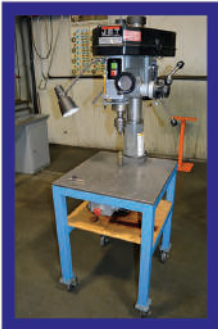
Jet Milling Drilling Model JMD-15 1 HP with Jacob 1/2" Chuck on HD Rolling Shop Cart