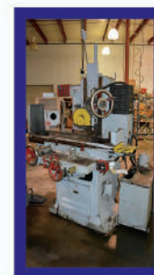
Nevtrol Electro-Matic, Vandyck Churchill Company Electric Surface Grinder,