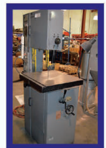
Jet VBS 14 Vertical Band Saw Capacity 1/8" - 5/8", 1hp

If You Want to Sell Your Shop or Business Assets or Know Someone Who Does? Call Us @ (480) 455-3910 | We Pay Great Finder's Fees!