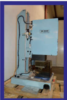
2030 Thermal Assembly System, Tsman (New)

Complete Terms & Conditions are available online @ www.kdauctions.com