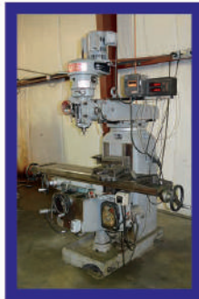
Exacto Knee Mill with HD Vise & Sargon Digital