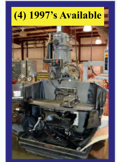
(4) 1997's Available 1997 Bridgeport Series 1 CNC, Model V2XT, 3 Phase