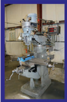
Bridgeport Knee Mill, Mdl 52757, Sargon DRO