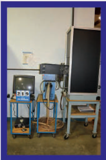
Part Marking Laser

This brochure is only a partial listing. Please visit our website and bid online @ www.kdauctions.com