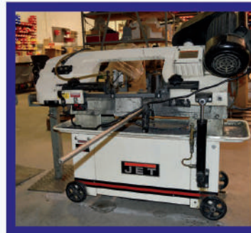
Jet Portable Horizontal Band Saw with Coolant, 3/4 hp