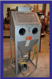
Trinco Dry Blast Sand Blasting Unit with Dust Collector Model 24-LP2