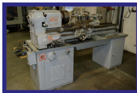
Logan Turret Lathe, Model 6561 H, 9" 3 Jaw Chuck, Tailstock