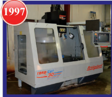
1997 Bridgeport Torq-cut 30 6" Kurt Vise, DX-32 Control, 22 ATC