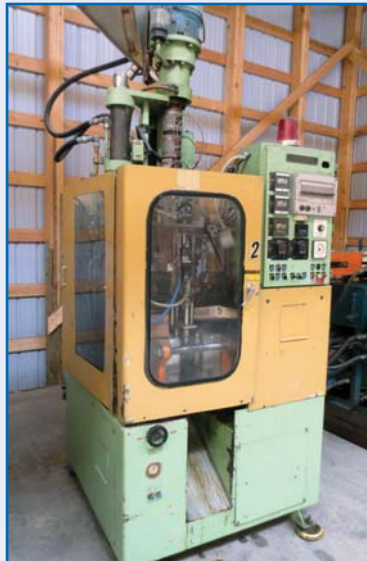
1979 HAYSSEN 2125 single extrusion, single die blow molder with extra die head and manual loader, 220 volt s/n na #2