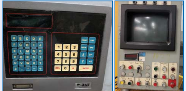
1991 BEKUM H-155 single extrusion, double die blow molder with MACO 8000 control, 90mm extruder, 11.2 ton clamping force, 2 sec. dry cycle, molds: 480mm width, 470mm length, (2) 130mm depth, 220mm daylight, vacuum loader, 480 volt, comes with (2) 5L F-Style Jug molds, 38-400 neck size s/n 155D004.5 #12