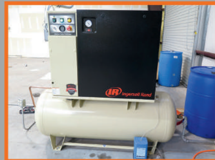
Ingersoll Rand mdl. UP6-15c TAS-125 W/D 15Hp Rotary Air Compressor