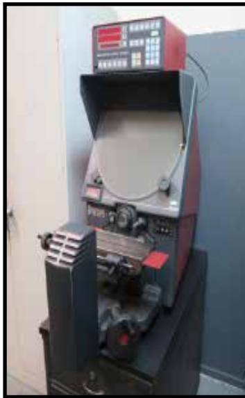
STARRETT SIGMA HE400 16" OPTICAL COMPARATOR