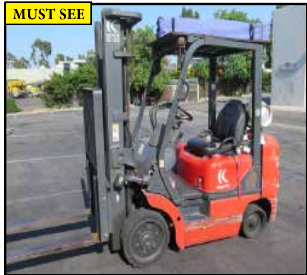
MUST SEE KALMAR C50BX PS 4480 LB CAP LPG FORKLIFT