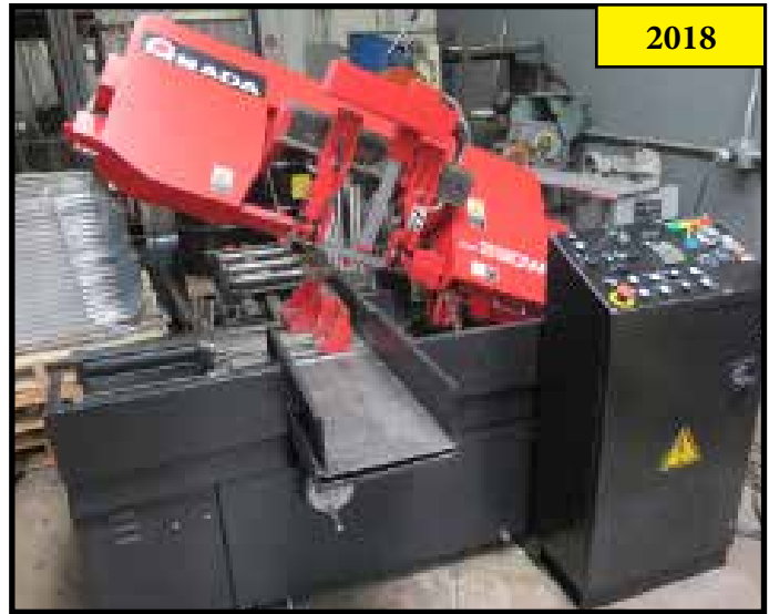
MAY/2018 AMADA HA-250W 10" AUTOMATIC HYDRAULIC HORIZONTAL BAND SAW W/ AMADA CONTROLS