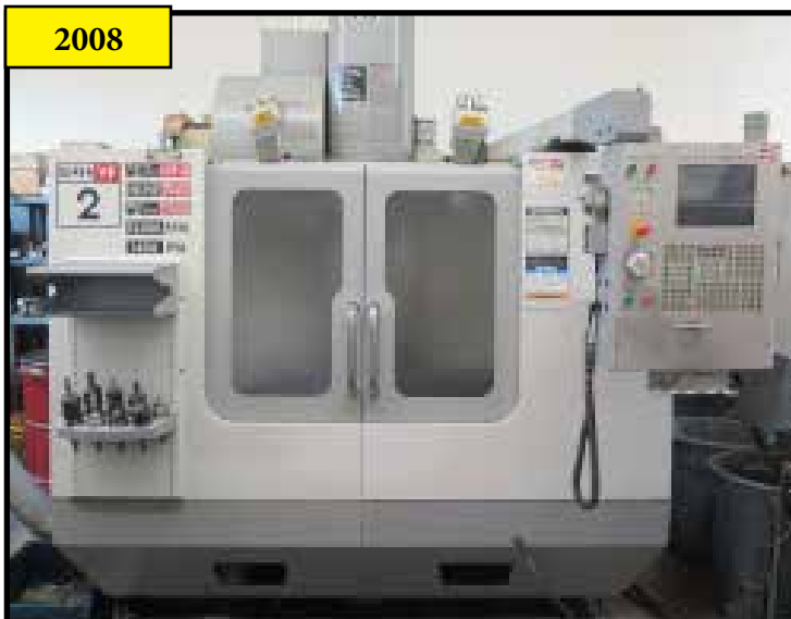
2008 HAAS SUPER VF-2SS 4-AXIS CNC VERTICAL MACHINING CENTER W/ HAAS CONTROLS, 24-STATION SIDEMOUNT ATC, CAT-40 SPINDLE, 12,000 RPM