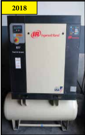
2018 2018 INGERSOLL RAND R111-A135 TAS 15HP ROTARY AIR