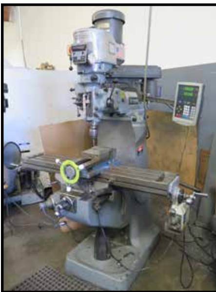
RIDGEPORT VERTICAL MILL S/N HDNG2365 W/ NEWALL C80 PROGRAMMABLE DRO, 2HP MOTOR, 60-4200 DIAL CHANGE RPM, CHROME WAYS, POWER FEED, 9" X 48" TABLE.