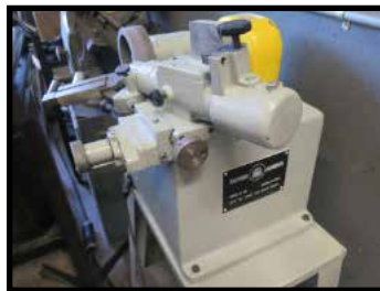
OLIVER ADRIAN 21HD PRECISION DRILL SHARPENER