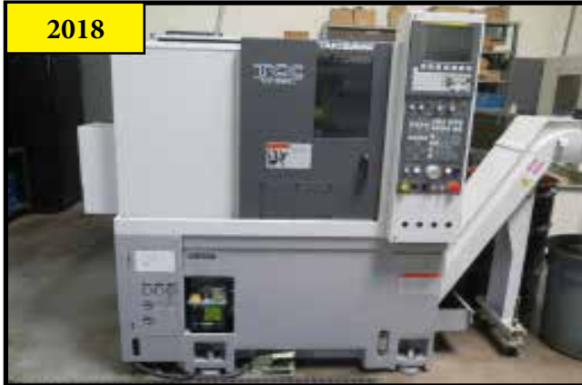
2018 TAKISAWA JAPAN TCC-2100 L3 CNC TURNING CENTER W/ FANUC 0I-TF CONTROLS, 12-STATION TURRET