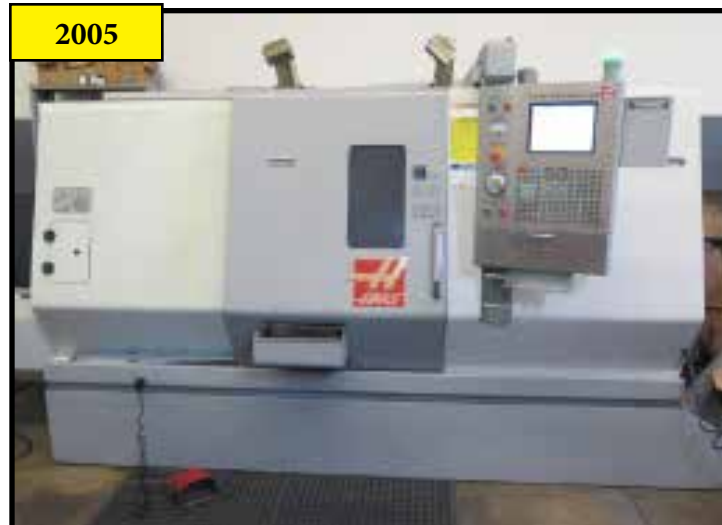
2005 HAAS SL-30 CNC TURNING CENTER W/ HAAS CONTROLS, TOOL PRESETTER, 12-STATION TURRET