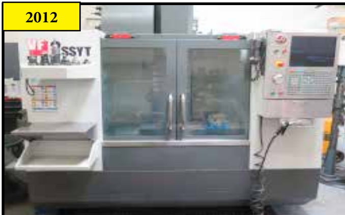
DEC/2012 HAAS VF-2SS YT 5-AXIS CNC VERTICAL MACHINING CENTER W/ HAAS CONTROLS, 24-STATION SIDE MOUNT ATC, CAT-40 SPINDLE, 12,000 RPM