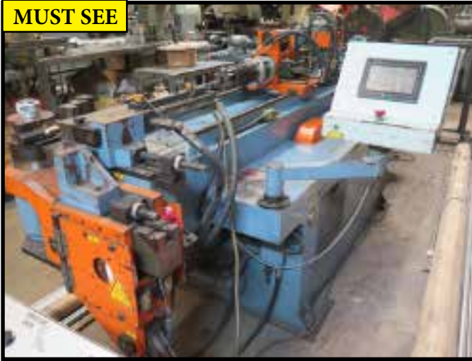
2000 SOCO SB-38NCMP 38MM NC HYDRAULIC TUBE BENDER W/ PLC CONTROLS