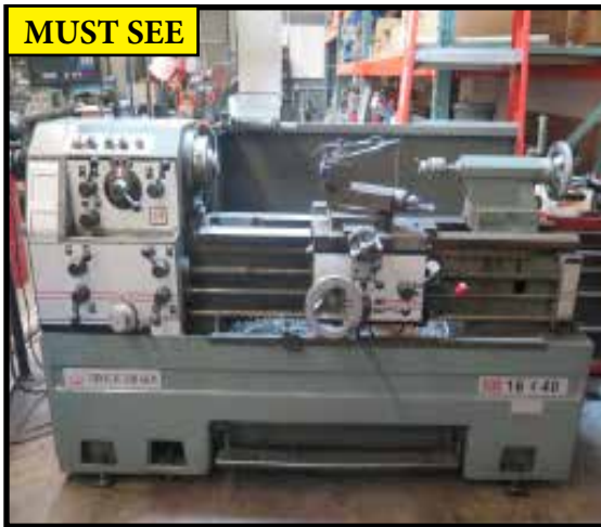
ACRA TURN 16X40 16" X 40" GEARED HEAD GAP BED LATHE W/ NEWALL TOPAZ DRO