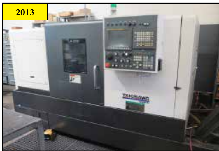
2013 TAKISAWA LA-250 CNC TURNING CENTER W/ TAKISAWA TURN - I FANUC CONTROLS, 10-STATION TURRET, BOX WAY