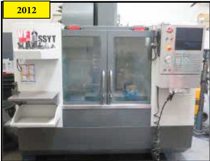
DEC/2012 HAAS VF-2SS YT 5-AXIS CNC VERTICAL MACHINING CENTER W/ HAAS CONTROLS, 24-STATION SIDE MOUNT ATC, CAT-40 SPINDLE, 12,000 RPM