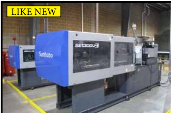
VIEW OF SUMITOMO ELECTRIC INJECTION MOLDERS

Directions : FROM SALT LAKE CITY TAKE I-15 SOUTH AND EXIT CENTER ST., TURN RIGHT ON TO CENTER ST., THEN TURN LEFT ON TO GENEVA RD, THEN TURN RIGHT ON TO W. 1000 S, THEN TURN LEFT ON TO S. 1680 W, THEN LEFT ON TO W. 1050 S., THEN TURN RIGHT ON TO S. 1675 W.