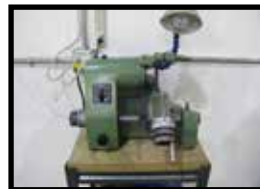
SINGLE LIP GRINDER