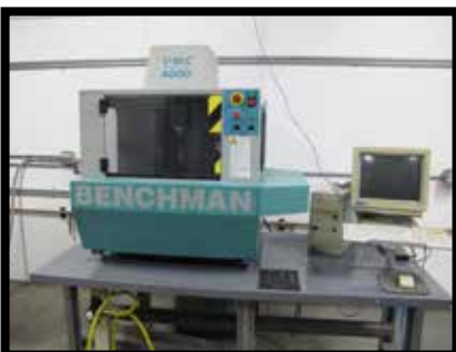
BENCHMAN VMC 4000 CNC HIGH SPEED VMC