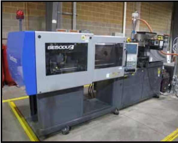
2010 SUMITOMO SE50DUZ, DIRECT DRIVE 55 TON ELECTRIC INJECTION MOLDER, W/1.7 OZ SHOT, 19.69" X 17.71" PLATTEN, N9 CNC CONTROLLER