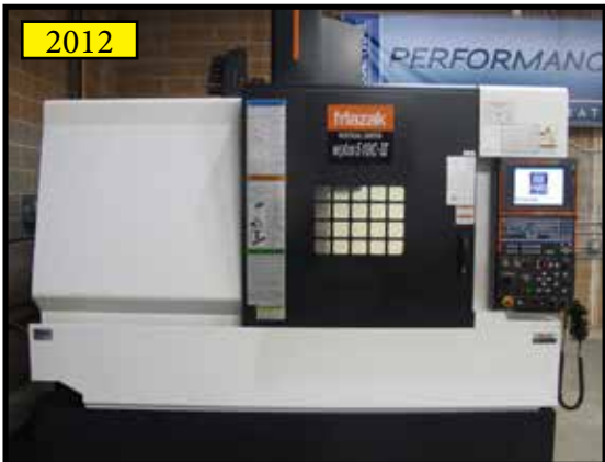
2012 MAZAK NESUS 510C-IT CNC VMC, 12000 RPM, MEZATROL MATRIX CONTROL, 41.34" X 20.87" X 20.08" (XYZ), CT-40, PROB SYSTEM, COOLANT THRU, 30 ATC, 645 CUTTING HOURS