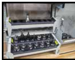
CT-40 TOOL HOLDER AND SPRING COLLETS