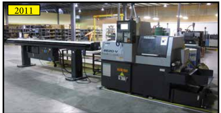
2011 TUGAMI BE20-V 5 AXIS CNC SCREW MACHINE W/LNS BAR FEEDER