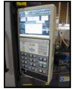
2011 SUMITOMO SE130DUZ, 143 TON DIRECT DRIVE ELECTRIC INJECTION MOLDING MACHINE, 2.9 OZ SHOT, 28.35" X 26.38" PLATTEN SIZE.