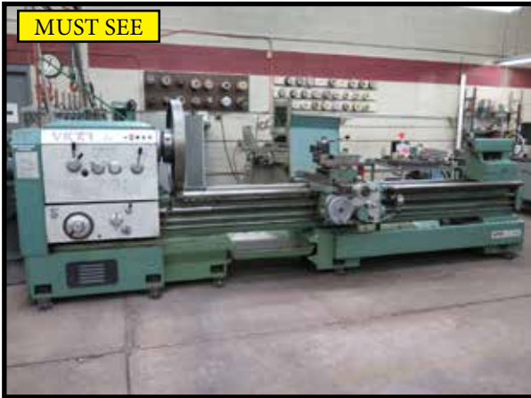
Victor mdl. 32120HD 32" x 120" Geared Head Gap Bed Lathe s/n C38 ***4" Bore Thru Spindle