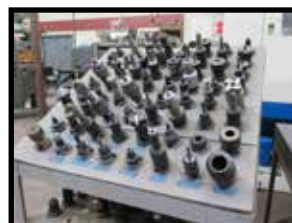
CAT-40 Taper Tooling