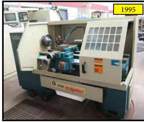
1995 Romi-Bridgeport EZ-Path 17" x 44" CNC Lathe s/n 002-079481- 325 w/ EZ-Path CNC Controls