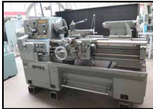
Mori Seiki mdl. MS-850G 17" x 36" Geared Head Gap Bed Lathe s/n 2927