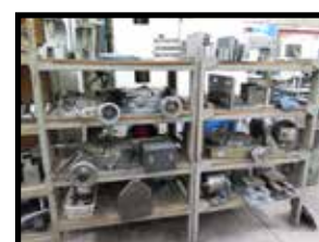
Partial View of Tooling