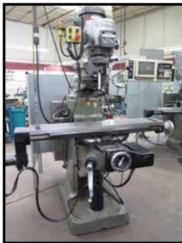
Bridgeport /EZ-Trak 2-Axis CNC Vertical Mill s/n 270218E w/ EZ-Trak SX CNC Controls