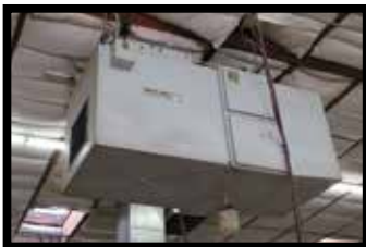
Smog-Hog Industrial Air Cleaner