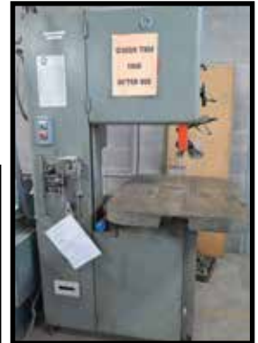
Groh mdl. 4V-18 18" Vertical Band Saw s/n 3123