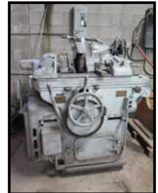
Landis 8" x 18" Plain Cylindrical Grinder s/n 12471