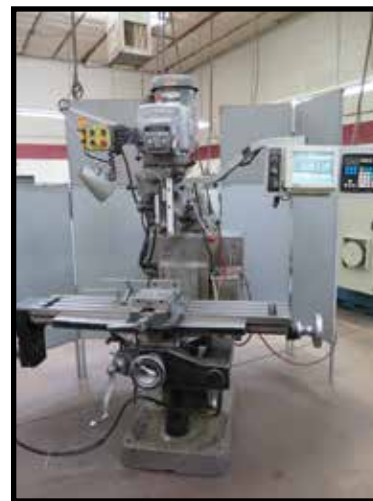
Bridgeport /EZ-Trak 2-Axis CNC Vertical Mill s/n 263767E w/ EZ-Trak SX CNC Controls