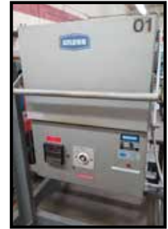
Cress mdl. C1228K Electric Furnace