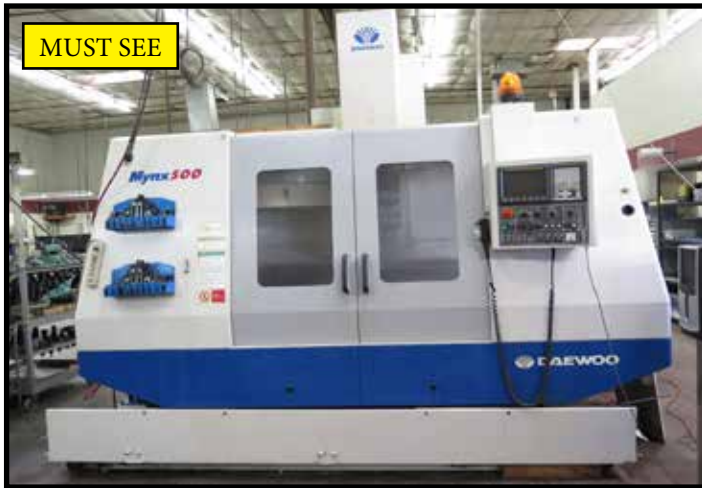
Daewoo Mynx 500 CNC Vertical Machining Center w/ Fanuc Series 21-M Controls