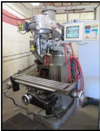
Bridgeport /EZ-Trak 2-Axis CNC Vertical Mill s/n 263202E w/ EZ-Trak DX CNC Controls