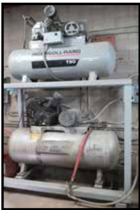
Bridgeport /EZ-Trak 2-Axis CNC Vertical Mill s/n 270218E w/ EZ-Trak SX CNC Controls