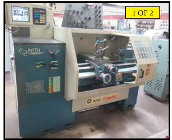
1995 Romi-Bridgeport EZ-Path 17" x 44" CNC Lathe s/n 002-079481-325 w/ EZ-Path CNC Controls