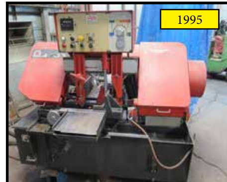
1995 Amada HA-250 10" Automatic Hydraulic Horizontal Band Saw s/n 25400338