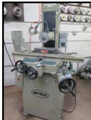
Mitsui mdl. 200MH 6" x 12" Surface Grinder s/n 82013143