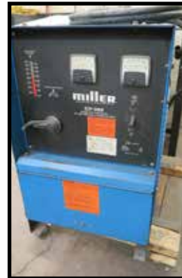
Miller CP-300 Welder