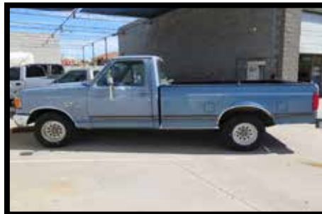
1991 Ford F150 XLT Lariat Pickup Truck