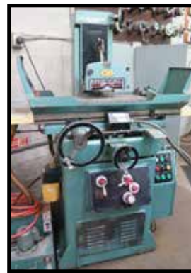
8" x 18" Automatic Surface Grinder