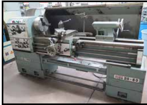
Acra-Turn mdl. LS-510 20" x 60" Geared Head Gap Bed Lathe s/n 830101