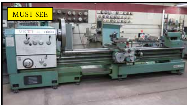
Victor mdl. 32120HD 32" x 120" Geared Head Gap Bed Lathe s/n C38 ***4" Bore Thru Spindle