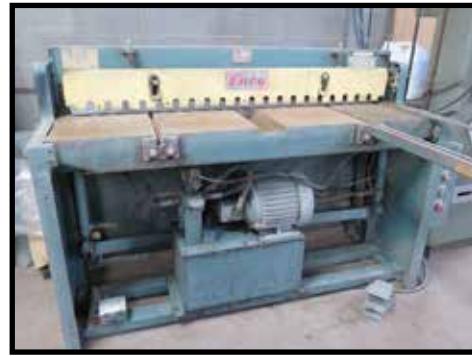
Enco mdl. 130-5345 52" Power Shear s/n 7910008