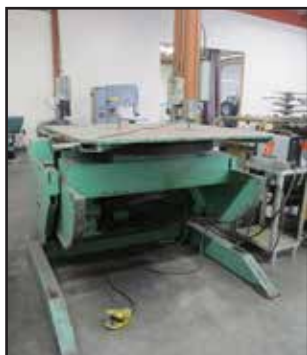
IRCO 10,000 LB 48"X48" ROTORITED WELDING POSITIONER