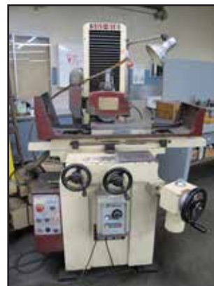
1995 KENT SGS 816MR 8" X 16" SURFACE GRINDER S/N 522018 W/ WALKER FINE-LINE ELECTROMAGNETIC CHUCK.