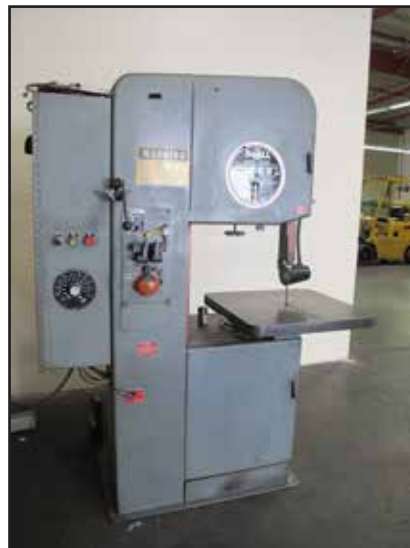
DOALL 2013-20 20" VERTICAL BAND SAW S/N 377-80535 W/ BLADE WELDER, 0-5200 DIAL FPM, 26" X 26" MITER TABLE.