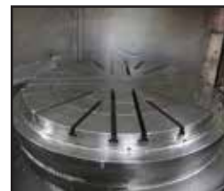
Shibaura TSN-13A CNC Vertical Boring Mill s/n 410107 w/ Fanuc System 6T Controls, 49" Chuck, 67" Max Swing.