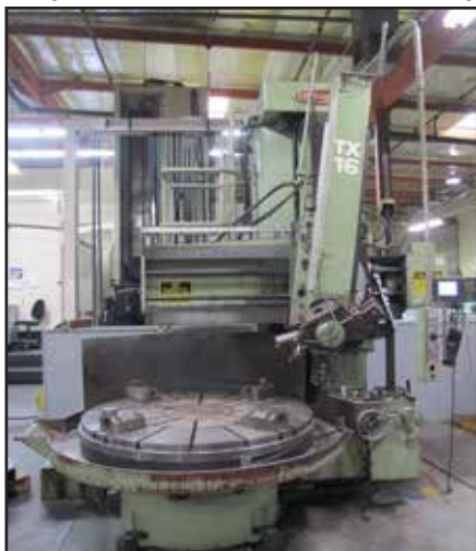
Shibaura TX16 Twin Head Vertical Turret Lathe s/n 320237 w/ Anilam Wizard550 DRO, 5-Station Turret Head, Facing/Boring Head, Inch Threading, 63" Chuck, 86" Max Swing.