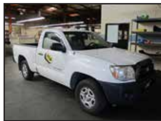
2001 Isuzu V8 EFI 12' Stake Bed Truck Lisc# 6V66728 w/ Gas Engine, Automatic Trans, 242,167 Miles, VIN# 4KLC4B1R01J804398.