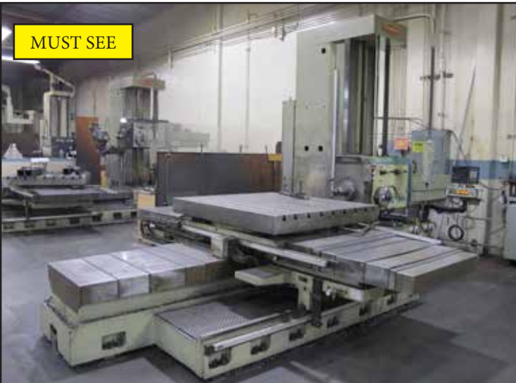
Shibaura BT-10BR3PD Horizontal Boring Mill s/n 123451 w/ Acu-Rite 3-Axis Programmable DRO, 20-1000 RPM, 4" Spindle, 50-Taper Spindle, Power Feeds, 55" x 63" Indexing Table, Bridgeport "J" Milling Head with 1.5Hp Motor, 60-4200 Dial RPM, Custom Adaptor Plate.