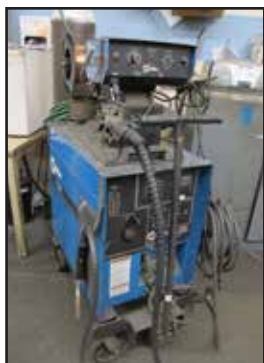
MILLER MIG AND TIG WELDERS