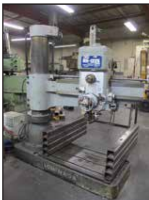
TOMINAGA / YMG RH-1225 12" COLUMN X 36" RADIAL ARM DRILL S/N 80120 W/ 90-2010 RPM, POWER COLUMN AND FEEDS, 29" X 52" TABLE AREA.