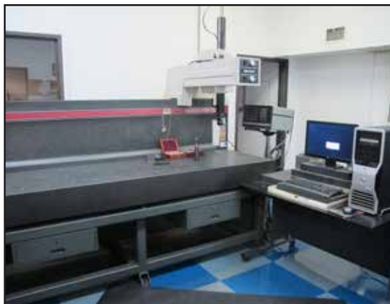
Sheffield Cordax 1808-mm CMM Machine s/n C-6163- 0490 w/ Sheffield 3-Axis Programmable DRO, Renishaw PH-8 Probe, 37" x 104" Granite Table, Approx 18" x 80" x 18" Work Envelope, Computer.