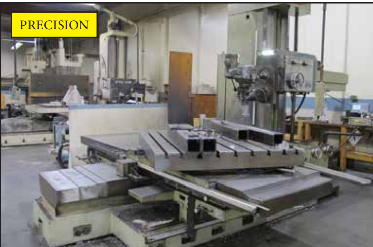
Shibaura BT-10BR3PD Horizontal Boring Mill s/n 123451 w/ Acu-Rite 3-Axis Programmable DRO, 20-1000 RPM, 4" Spindle, 50-Taper Spindle, Power Feeds, 55" x 63" Indexing Table, Bridgeport "J" Milling Head with 1.5Hp Motor, 60-4200 Dial RPM, Custom Adaptor Plate.