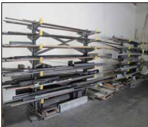
LARGE QUANTITY OF METALS