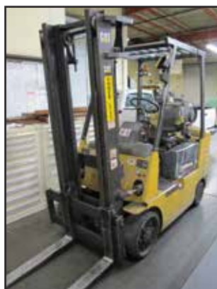
Caterpillar CG25 5000 Lb Cap LPG Forklift s/n 4EM06692 w/ 2-Stage Mast, 132" Lift Height, Solid Tires.