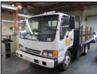
2001 Isuzu V8 EFI 12' Stake Bed Truck Lisc# 6V66728 w/ Gas Engine, Automatic Trans, 242,167 Miles, VIN# 4KLC4B1R01J804398.

SHIBAURA BT-10BR3PD HORIZONTAL BORING MILL S/N 123451 W/ ACU-RITE 3-AXIS PROGRAMMABLE DRO, 20-1000 RPM, 4" SPINDLE, 50-TAPER SPINDLE, POWER FEEDS, 55" X 63" INDEXING TABLE, BRIDGEPORT "J" MILLING HEAD WITH 1.5HP MOTOR, 60-4200 DIAL RPM, CUSTOM ADAPTOR PLATE. SHIBAURA BT-10BR3PD HORIZONTAL BORING MILL S/N 123650 W/ ANILAM WIZARD 3-AXIS DRO, 20-1000 RPM, 4" SPINDLE, 50-TAPER SPINDLE, POWER FEEDS, 55" X 63" INDEXING TABLE.