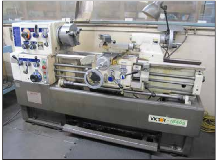
VICTOR 1640S, 16X40 ENGINE LATHE W/ THREADING