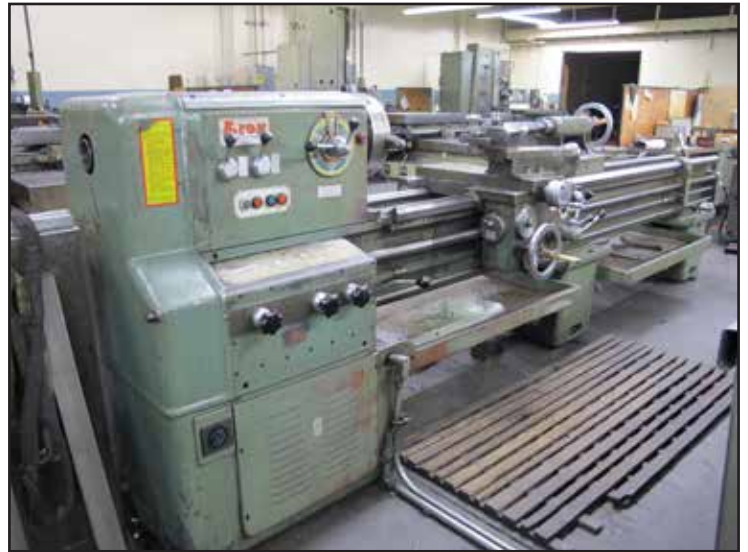
LYON C10MB 22" X 126" GEARED HEAD GAP BED LATHE S/N 10900 W/ 16-2000 RPM, TAPER ATTACHMENT, INCH/MM THREADING, TAILSTOCK, 2 3/4" THRU SPINDLE BORE, KDK TOOL POST, 12" 3-JAW CHUCK.