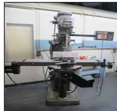
BRIDGEPORT SERIES WITH PROTRAK PROGRAMMABLE DRO.