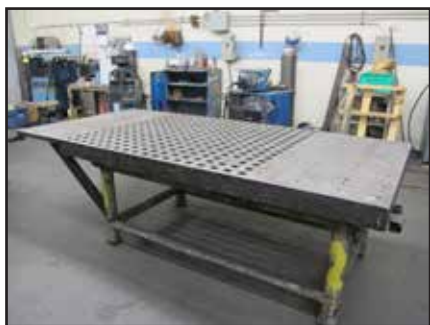
A-CORN TABLE 49"X100"