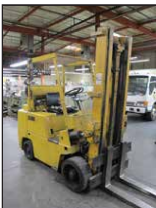
Clark C500S80 8000 Lb Cap LPG Forklift s/n 68524241679 w/ 2-Stage Mast, 171" Lift Height, Solid Tires.