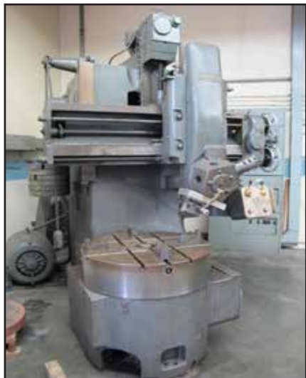
Webster & Bennette 36" Vertical Turret Lathe s/n 610553 w/ 13.5-300 RPM, 5-Station Turret, 36" Chuck, 50" Swing.