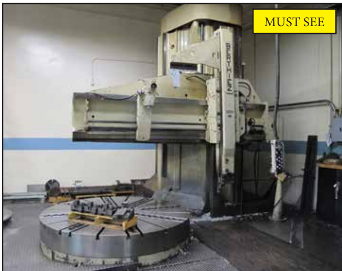
Berthiez BM225 Open Sided Vertical Boring Mill s/n 200232-NW w/ 0-125 RPM, Tracing Attachment, 88 1/2" Chuck, 152" Max Swing.