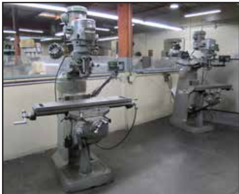
BRIDGEPORT SERIES 1 - 2HP VERTICAL MILL S/N 249925 W/ SONY MILLMAN DRO, 60-4200 DIAL RPM,