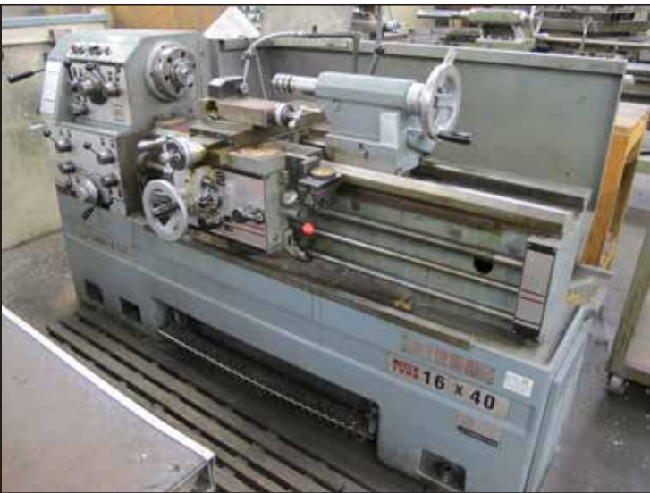
WEBB MECCA TURN 16X40 ENGINE LATHE, in/mm THREADING 10" 3 JAW CHUCK