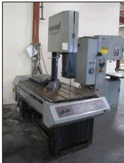
MARVEL SERIES 8 MARK II 18" VERTICAL MITER BAND SAW W/ MANUAL CLAMPING, 45 DEGREE MITER CAPAB.