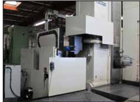
2012 TOSHIBA BP-150.R22 CNC HORIZONTAL BORING MILL S/N 421541 W/ TOSNUC 999 CONTROLS, 60-STATION ATC, CAT-50 TAPER SPINDLE, 6" SPINDLE, 70.9" X 86.6" TABLE INDEXABLE @ 90 DEGREES, 7717 ON HOURS, 2066 SPINDLE HOURS, 1565 CUTTING HOURS.