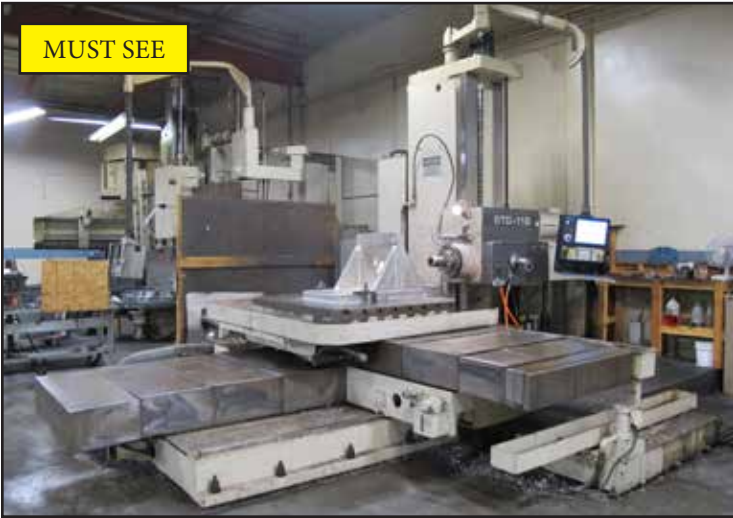
Shibaura TSN-13A CNC Vertical Boring Mill s/n 410107 w/ Fanuc System 6T Controls, 49" Chuck, 67" Max Swing.