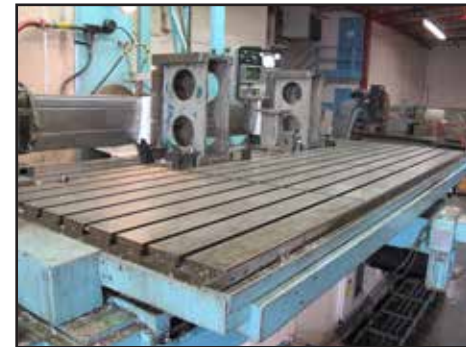
DEVLIEG SPIRAMATIC 65K-144 4-AXIS CNC HORIZONTAL BORING MILL S/N 4935 W/ FANUC SERIES 16-M CONTROLS, HAND WHEEL, 10-1800 RPM, 6" SPINDLE, 50-TAPER SPINDLE, 60" X 144" TABLE, 50" X 72" 4 TH AXIS ROTARY TABLE.