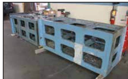
MOUNTING BLOCK FOR HBM'S