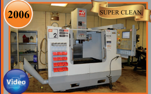
2006 Haas VF-2, 10K Spindle, 2 Speed Gear Box, Travels 30" x 16", 20" Auger, Coolant S/N 48035

Lots Begin Closing: Mon., Feb. 16, 2015 12:00 Noon (EST) Inspection: Morning of sale, Mon., Feb. 16, 2015 8:30 am-10:00 am Location: 14004-H Willard Rd, Chantilly, VA 20151