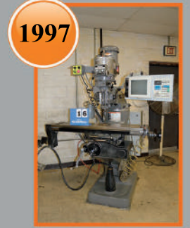
1997 Bridgeport EZ Trak DX CNC Knee Mill, Travels 30" x 12" x 16"