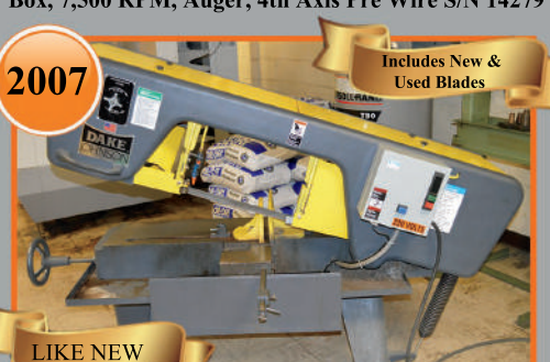
2007 Drake Johnson Horizontal Bandsaw, 220V Single Phase, 1 HP, 1725 RPM, Model JH10, Blade Size 115 x 1.035-10/14 V VR, S/N 1032096