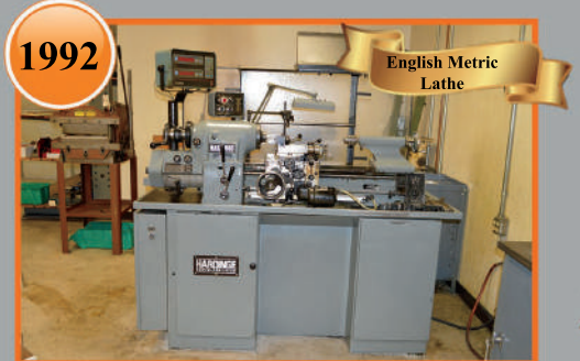
1992 Hardinge Super Precision (ENGLISH METRIC SYSTEM), Acu-Rite III DRO Model HLV-EM, 1.5 HP, S/N HLV-H-13868-T

Several Lots of, Kurt Vices, End Mills & Tooling