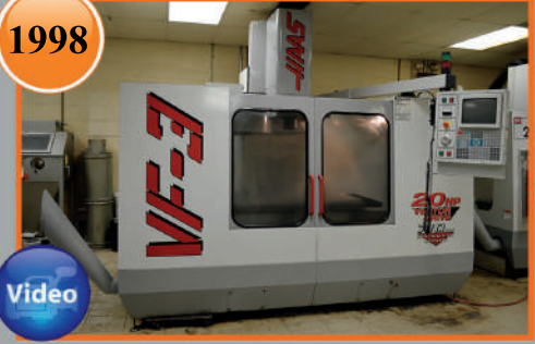
1998 Haas VF-3, Travels 40" x 20" x 25", 2 Speed Gear Box, 7,500 RPM, Auger, 4th Axis Pre Wire S/N 14279

website and bid online @ www.kdauctions.com