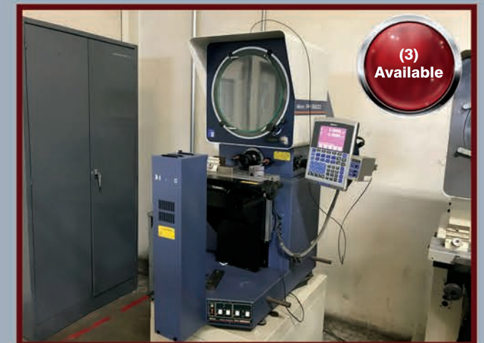
(3) Mitutoyo PH-3500 Optical Comparator