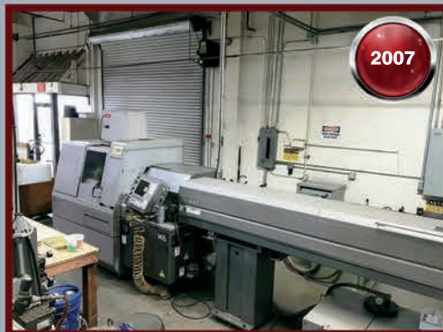
2007 Citizen M16 III CNC Swiss, Citizen CAV 16M-IS Barfeeder, Citizen Cool Blaster, MistBuster