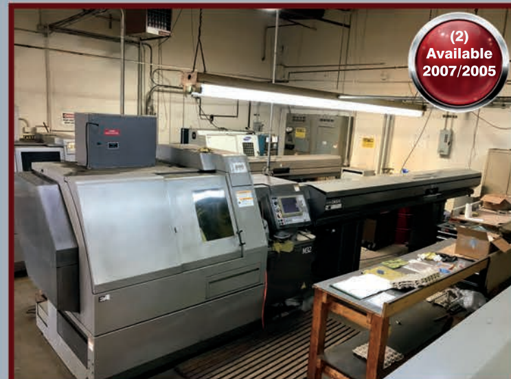
(2) 2007/2005 Citizen M32 V CNC Swiss, Citizen CAV 32-IS Barfeeder, Citizen Cool Blaster, MistBuster