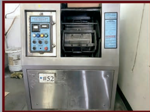
Richwood Industries Controlled Velocity CV-600 Barrel Grinder

Lots Begin Closing: Tuesday, June 19, 2018 10:00 AM (PST) Inspection/Preview: Monday, June 18, 2018 9:00 AM - 3:00 PM (PST)