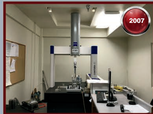
2007 Zeiss Contura G2 CMM