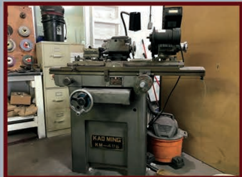
Kao Ming KM-40S Grinder