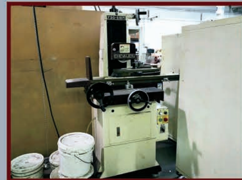
Chevalier FSG 618M Grinder