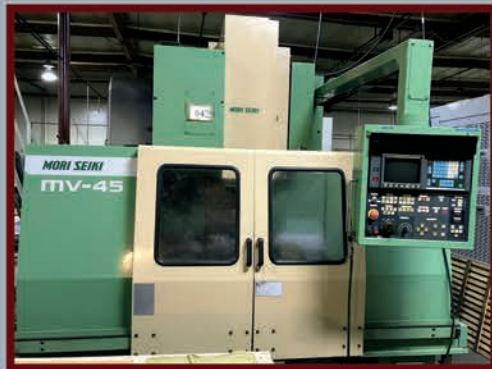
Mori Seiki MV-45B/40 CNC VMC, Fanuc MF-M4 Control, 30 ATC