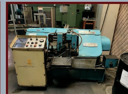
Daito GA 260W Saw