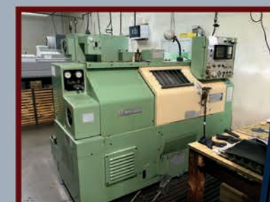
Mori Seiki AL-2 CNC Lathe, Fanuc 10T Cntrl, 8" 3-Jaw Chuck, Collet Chuck, Tailstock