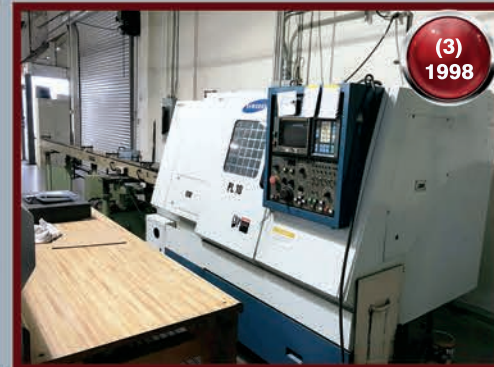
(3) 1998 Samsung PL-10 CNC Lathe, Fancu O-T, 8" 3-Jaw Chuck, 10 Station Turret, Tailstock, Omnibar SMW Systems Barfeeder