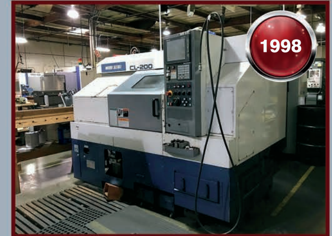
1998 Mori Seiki CL-200B500 CNC Lathe, MSC-803 Control, 8" MMK 3-Jaw Chuck, 10 Station Turret, Tailstock