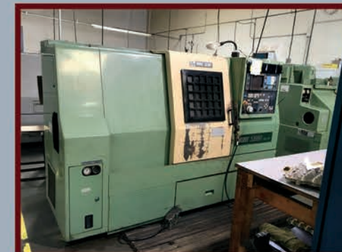
Mori Seiki SL-15 CNC Lathe, Fancu MF-4 Control, 6" Kitagawa 3-Jaw Chuck, 12 Station Turret, Tailstock