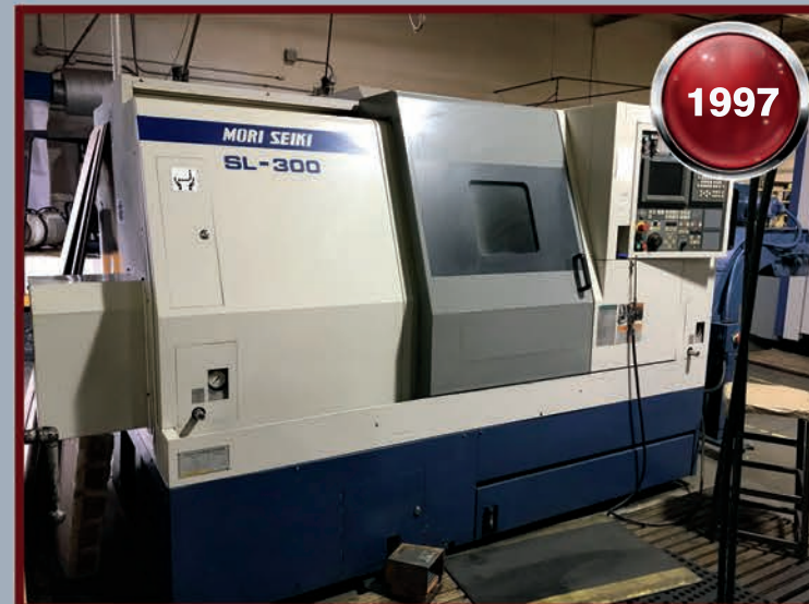
1997 Mori Seiki SL-300A CNC Lathe, Fanuc MSC-518 Cntrl, 12" Kitagawa 3-Jaw Ck, 12 Station Turret, Tailstock, Chip Conveyor