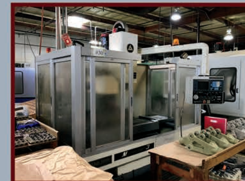
Kitamura Mycenter 3 CNC VMC, Fancu O-M Control, 30 ATC