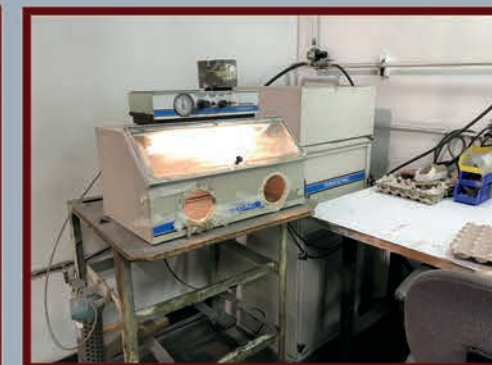
Comco Inc Blaster