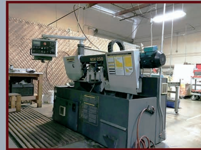
Hyd-Mech HSV-250 Saw