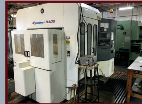
Kitamura Mycenter H400 CNC HMC, Fancu 15-M Control, 10,000 RPM, 100 ATC, Chip Conveyor