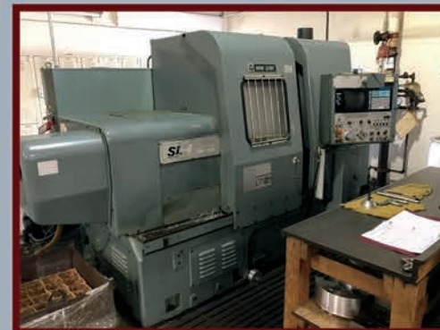
Mori Seiki SL-4C CNC Lathe, Yasnac Control, 15" Kitagawa 3-Jaw Chuck, 10 Station Turret, Tailstock