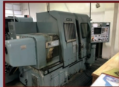
Mori Seiki SL-3H CNC Lathe, Fancu 11T Control, 10" Kitagawa 3-Jaw Chuck, 10 Station Turret, Tailstock