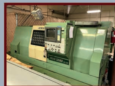
Mori Seiki SL-25B-1000 CNC Lathe, Fanuc 15-T Control, 10" Kitagawa 3-Jaw Chuck