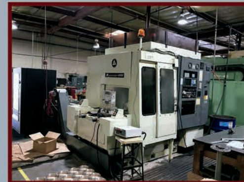
Kitamura Mycenter H300 CNC HMC, Fanuc Control, 4th Axis Ready, 100 ATC, Chip Conveyor