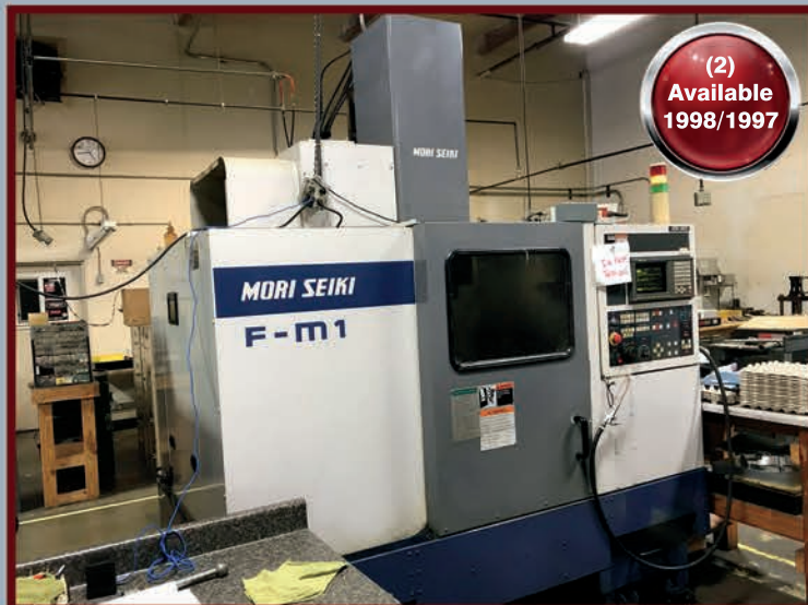
(2) 1998/1997 Mori Seiki F-M1 CNC VMC, Fanuc MSC-521 Control, 20 ATC