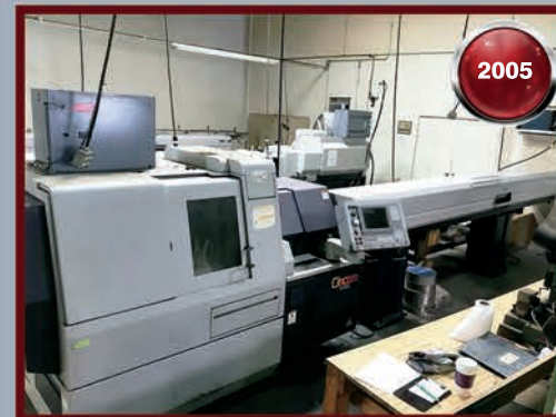
2005 Citizen M16 III CNC Swiss, Citizen CAV 16M-IS Barfeeder, Citizen Cool