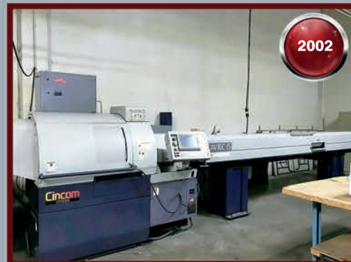
2002 Citizen C-16 CNC Swiss, Citizen CAV 16C-IS Barfeeder, Citizen Cool Blaster, MistBuster