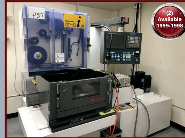
(2) 1999/1998 Fanuc Robocut Alpha I Series (Alpha-OiA)