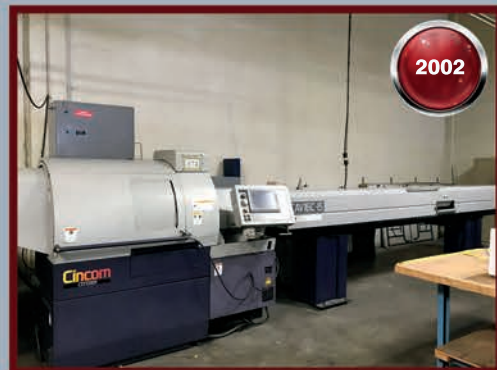
2002 Citizen C-16 CNC Swiss, Citizen CAV 16C-IS Barfeeder, Citizen Cool Blaster, MistBuster