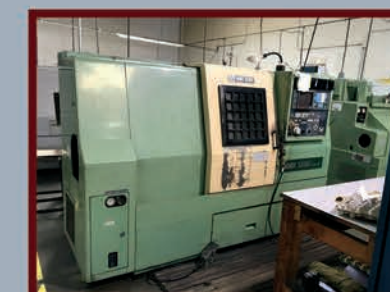
Mori Seiki SL-15 CNC Lathe, Fanuc MF-4 Control, 6" Kitagawa 3-Jaw Ck, Tailstock