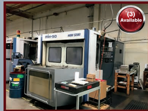
(3) Mori Seiki MH-50's, CNC HMC, Fanuc MF-M6 Control, 60 ATC, Chip Conveyor

This brochure is only a partial listing. Please visit www.kdauctions.com for a complete list and bid online