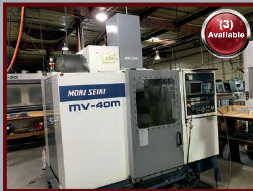
(3) Mori Seiki MV-40M CNC VMC, Fanuc MF-M7 Control, 20 ATC, 4th Axis Ready