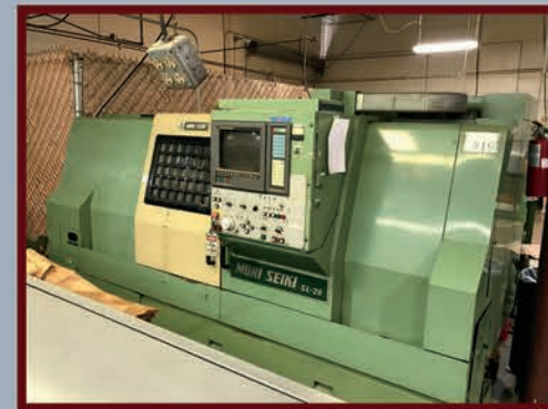
Mori Seiki SL-25B-1000 CNC Lathe, Fanuc 15-T Control, 10" Kitagawa 3-Jaw Chuck, 10 Station Turret, Tailstock