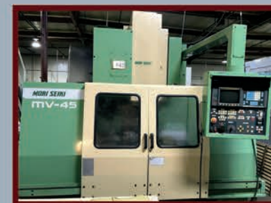
Mori Seiki MV-45B/40 CNC VMC, Fanuc MF-M4 Control, 30 ATC