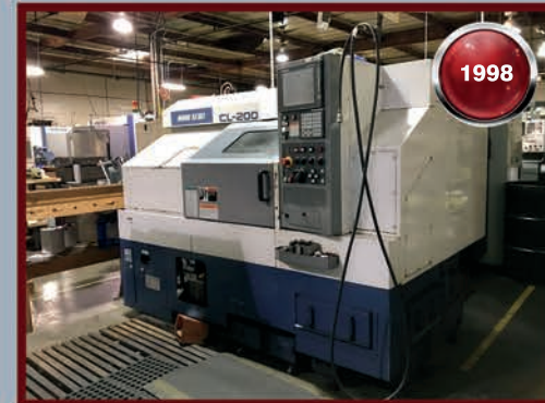
1998 Mori Seiki CL-200B500 CNC Lathe, MSC-803 Control, 8" MMK 3-Jaw Chuck, 10 Station Turret, Tailstock