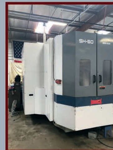
(2) 1996 Mori Seiki SH-50's, 19.7"/19.7" Pallets, 24.8" x 23.6" x 25.6" Travels, 12,000 RPM, Cat 40 Taper