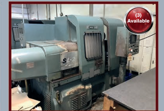
(3) Mori Seiki SL-2H CNC Lathe, Fancu 11T Control, 10" Kitagawa 3-Jaw Chuck, 12 Station Turret

Do You Want to Sell Your Shop or Business Assets or Know Someone Who Does? Call Us Today @ 480-455-3910 | We Pay Great Finder's Fees!