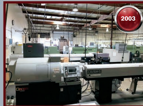
2003 Citizen C16 VII CNC Swiss, Citizen CAV 16M-IS Barfeeder, Citizen Cool Blaster, MistBuster