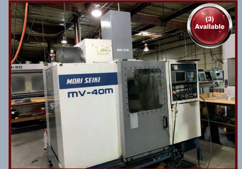
(3) Mori Seiki MV-40M CNC VMC, Fancu MF-M7 Control, 20 ATC, 4th Axis Ready