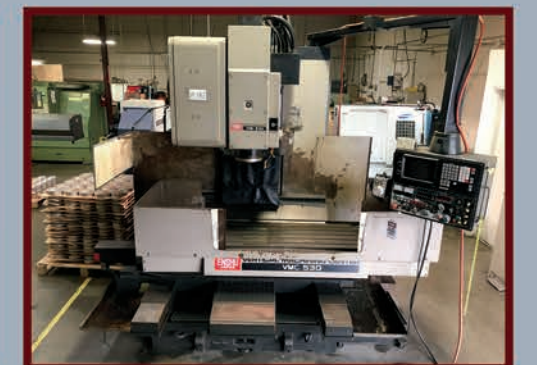
Enshu VMC 530 CNC VMC, Fancu 11M Control