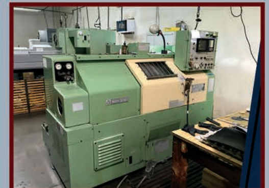
Mori Seiki AL-2 CNC Lathe, Fanuc 10T Control, 8" 3-Jaw Chuck, Collet Chuck, Tool Presetter, 12 Station Turret, Tailstock