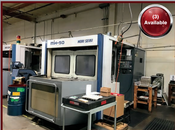
(3) Mori Seiki MH-50 CNC HMC, Fancu MF-M6 Control, 60 ATC, Chip Conveyor