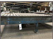
Acorn Platens Table 5' X 8'