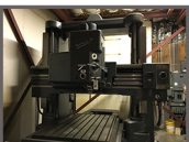
SIP Type ARM-67E Hydraulic 7A Jig Boring Machine