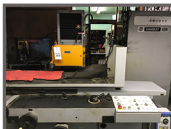
Blohm Hanseat 9 Surface Grinder