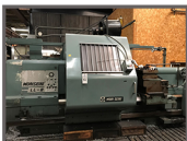
Mori Seiki LL-8/1500 51" Swing, 48" 4 Jaw Chuck