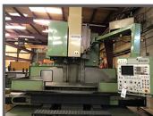
Mori Seiki MV-50W , CAT 50, 32 Position Tool Changer