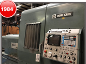
1984 Mori Seiki SL-6A 18" Chuck, 27" Swing