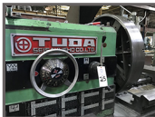
Tuda Jumbo Type Heavy Duty 40" X 240" GAP BED LATHE