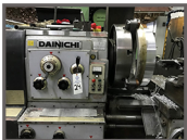
Dainichi DHK 75 X 200 Engine Lathe, 24" 4 Jaw Chuck, Swing Over Bed 30"