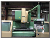
Mori Seiki MV-65, Scales &amp; 4th Axis