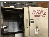
Hardinge Conquest T-51 CNC Lathe with GE Fanuc Series 18T Control