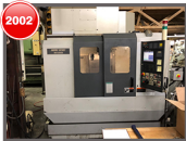
2002 Mori Seiki NV-5000, APPROX 4,000 Cut Hours, CAT 40, 12,000 RPM