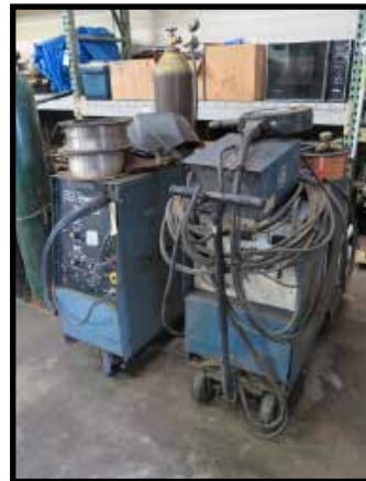
Miller CP-300 and CK Systematics FMP225 Arc Welders