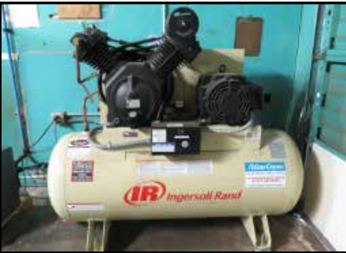
Ingersoll Rand mdl. 7100E15-VP 15Hp Horizontal Air Compressor