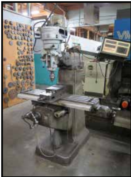
Sharp First mdl. IC-1 1/2 VH Vertical Mill w/ 60-4200 Dial Change RPM, Power Feed