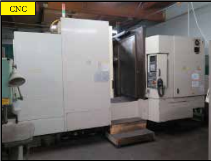
CNC Okuma & Howa "Millac 630H" 2-Pallet CNC Horizontal Machining Center w/ Fanuc 16-M Controls, 80-Station ATC, CAT-50 Spindle, 60-10,000 RPM, 4 th Axis Thru Pallets, (2) 24 3/4" x 24 3/4" Pallets with Tombstones