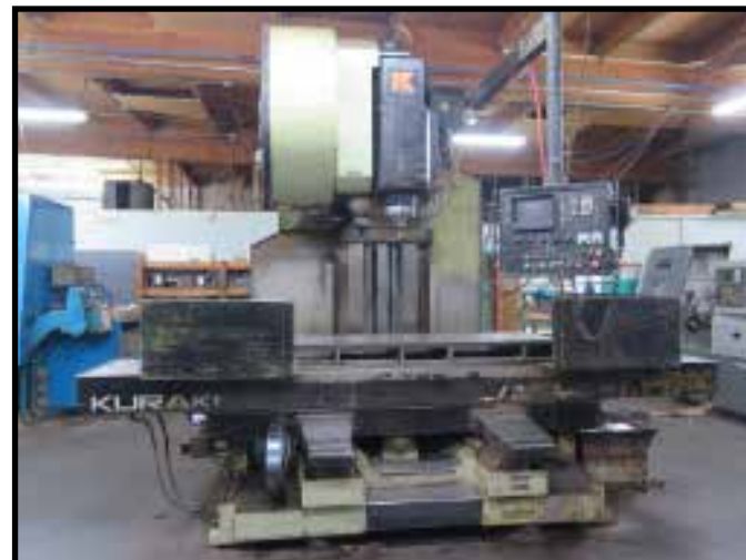
Kuraki KV1600 CNC Vertical Machining Center w/ Fanuc 11M Controls, 24-Station ATC, BT-50 Spindle, 3000 RPM