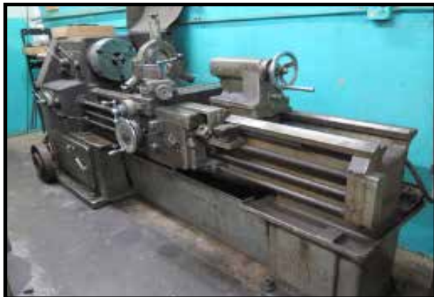
Mazak "18" 18" x 56" Geared Head Gap Bed Lathe w/ 25-1500 RPM, In/mm Threading, Tailstock, Steady Rest