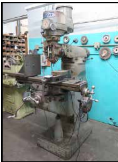
Bridgeport Vertical Mill w/ Anilam Wizard DRO