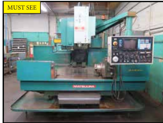
MUST SEE Matsuura MC-1000VS2 4-Axis CNC Vertical Machining Center w/ Yasnac M5X Controls, 20-Station ATC, BT-40 Spindle, 5000 RPM, 4 th Axis 12" Rotary Head with 8" 3-Jaw Chuck