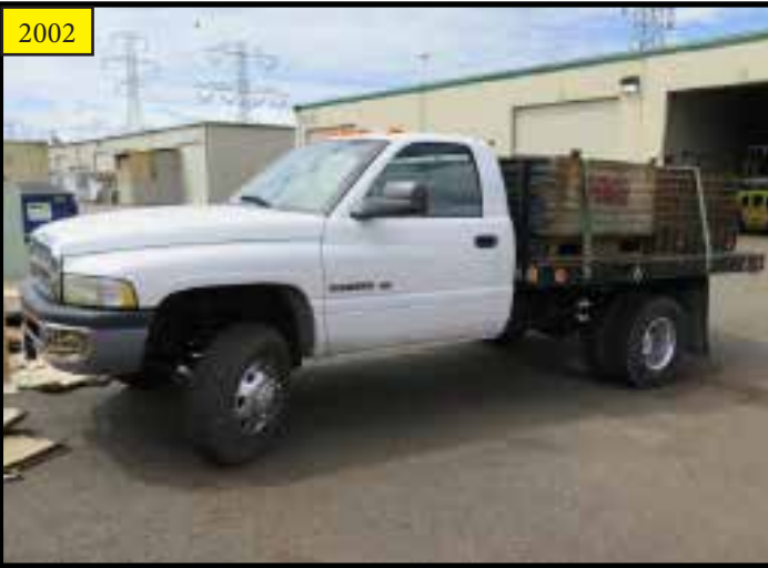
2002 Dodge RAM 3500 9&#39; Stake Bed Truck