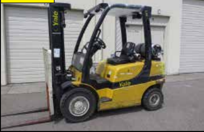
Yale 50VX 4800 Lb Cap LPG Forklift