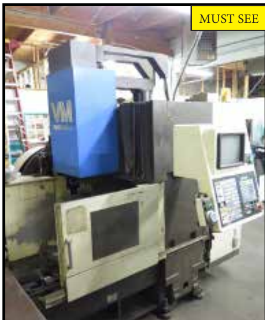
Hitachi Seiki VM-40 CNC Vertical Machining Center w/ Seicos CNC Controls, 20-Station ATC, CAT-40 Spindle