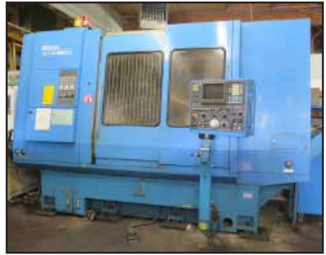
Miyano ATS-60S Twin Spindle CNC Turning Center w/ Fanuc 0T Controls, 12-Station ATC, Front and Rear Rigid Tool Holders, 15-3000 Main Spindle RPM, 45-4500 Sub Spindle RPM, 100-3000 Revolving Tooling RPM