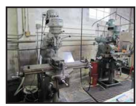
Bridgeport Vertical milling machines.