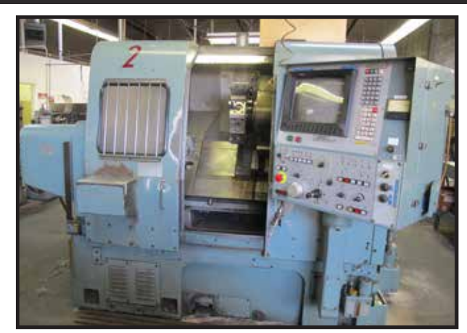
Mori Seiki SL-3H CNC Lathe, with 10" Chuck, 12 Station Turret, Fanuc 10TE-F control, s/n 4452.

H.E.S. HN-400 Engine Lathe with threading, s/n 13946.