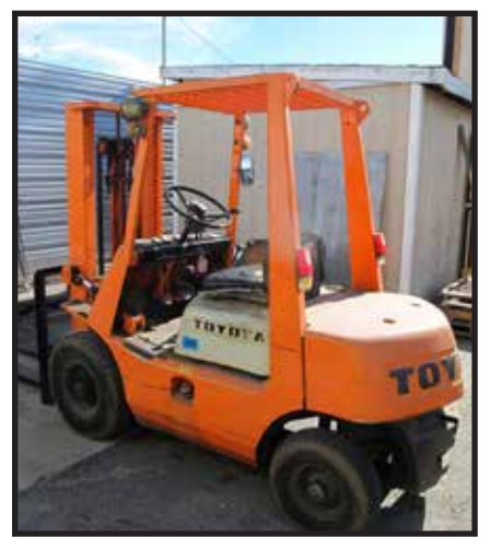
Toyota 2000 LB Forklift with pneumatic tires, 2 stage.