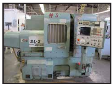
Mori Seiki SL-2B CNC Lathe, w/ Fanuc 6T control, 12 Station Turret, 10" Chuck, s/n 383.