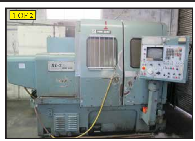
(1 of 2) Mori Seiki SL-3H CNC Lathe with Fanuc Control, 10" Chuck, 12 Position Turret.