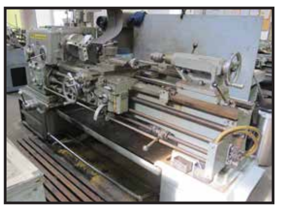
H.E.S. HN-400 Engine lathe with threading, tracer, s/n 13907.