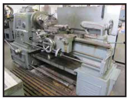
H.E.S. C450 Engine lathe with tracer, taper and threading.