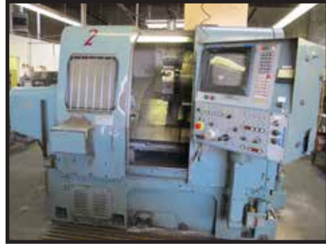
Mori Seiki SL-3H CNC Lathe, with 10" Chuck, 12 Station Turret, Fanuc 10TE-F control, s/n 4452.