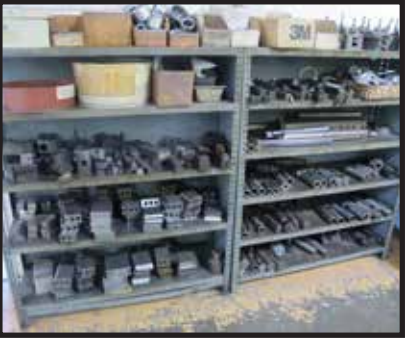
Large selection of tooling and support.