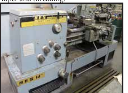
H.E.S. J-350 14" Engine lathe with taper attachment, threading, s/n 1545.