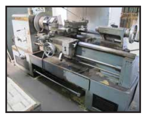
H.E.S. C-450, 18" Engine Lathe with Tracer, taper attachment, s/n 2862.