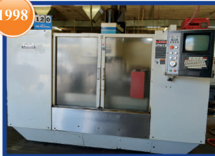
1998 Fadal VMC 5020A, VMC, Model 917-1