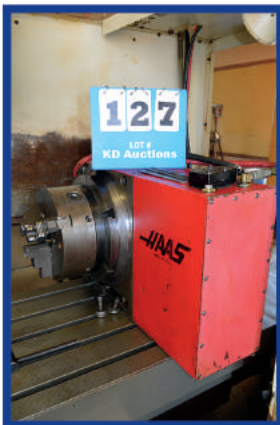
Haas HRT-310, 4th Axis Rotary Table