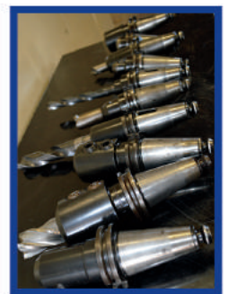
Various Lots of CNC Tooling