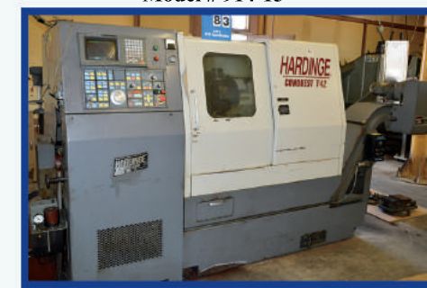
Hardinge Conquest T-42 CNC Lathe, Model SG-42