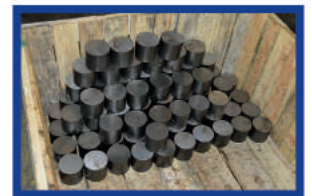
Over 10 Lots of Raw Material