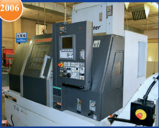
2006 Mori Seiki Dura Turn 2550 CNC Lathe