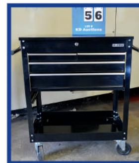
Multiple Lots of Heavy Duty Rolling Carts