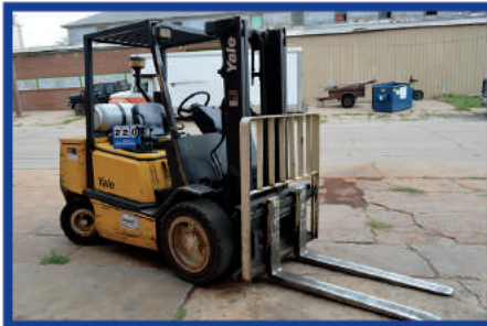
Yale Side Shift, Propane, 6500 Lbs Forklift

This brochure is only a partial listing. Please visit our website and bid online @ www.kdauctions.com