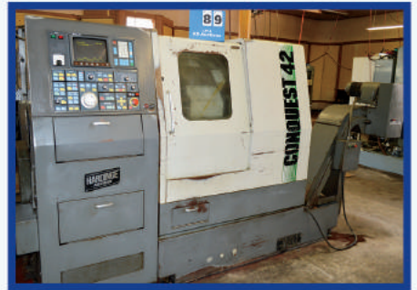
Hardinge Conquest 42 CNC Lathe