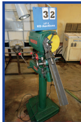
Sterling 3/4 HP Precision Drill Grinder