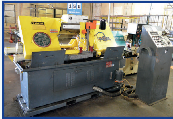
Do-All Horizontal Band Saw, Model C-1216NC