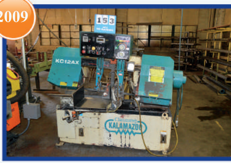
2009 Clausing Kalamazoo KC12AX, Model # H9813832-KH