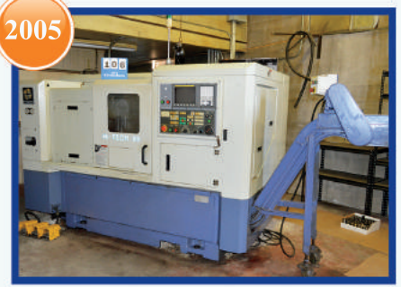
2005 Hwacheon Hi-Tech 200 CNC Lathe

If You Want to Sell Your Shop or Business Assets or Know Someone Who Does? Call Us @ (480) 455-3910 | We Pay Great Finder's Fees!