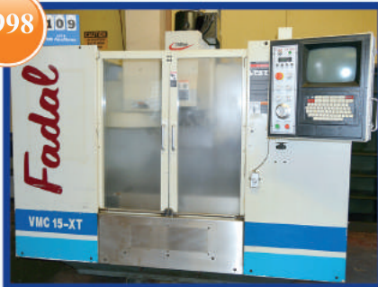
1998 Fadal VMC-15XT VMC, Model # 914-15