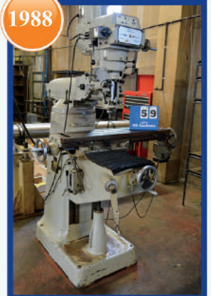
1988 EXA Knee Mill with Anilam Spirit II DRO