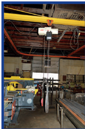
Overhead Gantry Crane