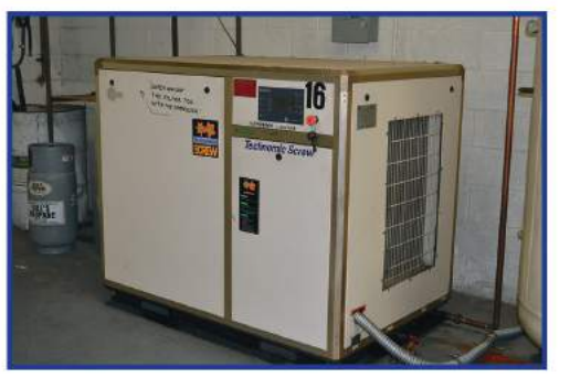
CoAire Screw Air Compressor Model CHSA-30, 125 PSI, 30 HP,