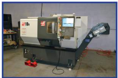
2015 Haas ST-10Y. Tool Presetter, Parts Catcher Live Tooling, Tailstock with Hydraulic Quill, Rigid Tapping, Spindle Orientation, C-Axis, Y-Axis, Chip Conveyor, Lifting Provision, 6.5" Hydraulic Chuck