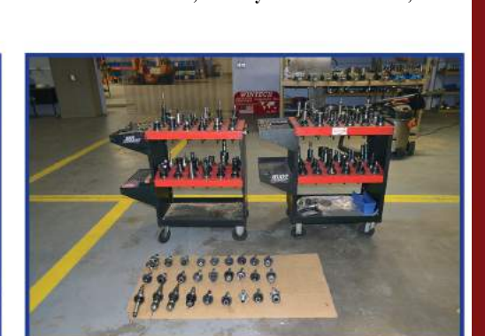
Cat 40 Tool Holders