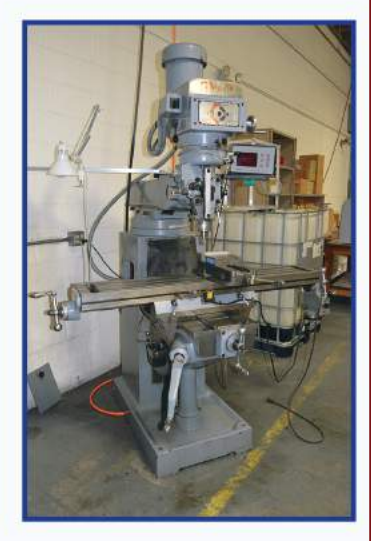
1996 Enco Knee Mill, Platinum Plus DRO, Servo Driven, 6" Kurt Vise