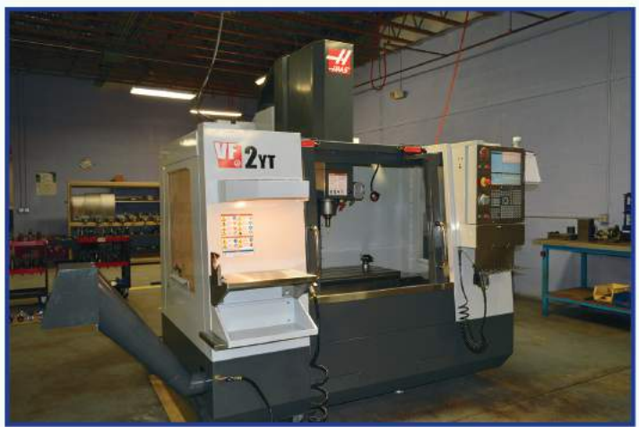
2014 Haas VF-2YT, P-Cool, Extended Y-Axis Travel, Chip Auger, 750 MB Expanded Memory, Rigid Tapping, WIPS (Renishaw Probing), 8,100 RPM, 20 ATC