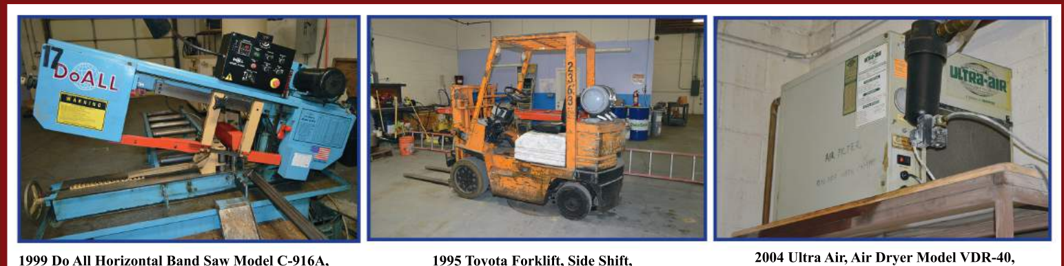
1999 Do All Horizontal Band Saw Model C-916A, Saw Blade Length 158"