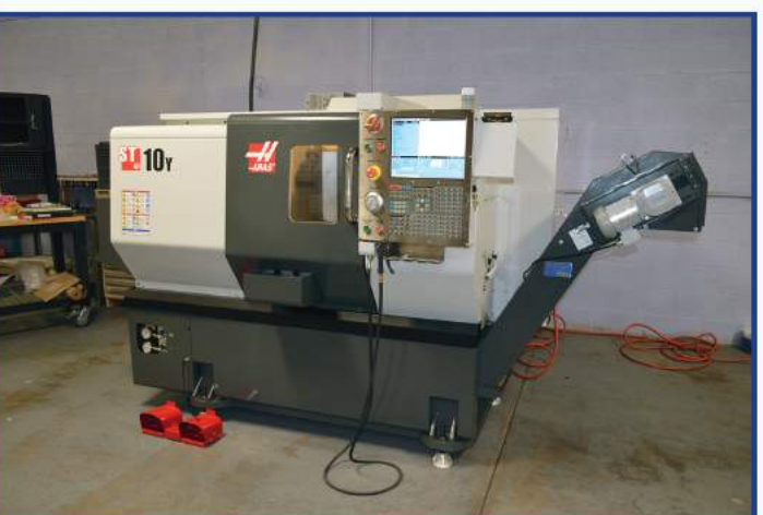
2015 Haas ST-10Y, Tool Presetter, Parts Catcher Live Tooling, Tailstock with Hydraulic Quill, Rigid Tapping, Spindle Orientation, C-Axis, Y-Axis, Chip Conveyor, Lifting Provision, 6.5" Hydraulic Chuck

Auction Starts: Wednesday, June 22, 2016 11:00 am (PDT) Inspection/Preview: Morning of Sale, 8:00 - 11:00 am (PDT) Location: 2206 S 2nd Pl., Phoenix, AZ 85004