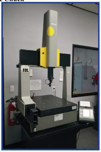
1999 Brown & Sharpe Gage 2000 CMM, Renishaw TP-ES Touch Probe