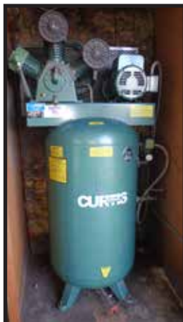
Curtis mdl. 5VT8-1 5Hp Vertical Air Compressor s/n AS4020513 w/ 3-Stage Pump, 80 Gallon Tank

TERMS OF SALE: CASH OR CASHIERS CHECK ONLY. 15% BUYERS PREMIUM ON ALL PURCHASES. $200.00 REFUNDABLE CASH DEPOSIT. 25% CASH DEPOSIT TOWARDS ALL PURCHASES. ALL SALES ARE SUBJECT TO CALIFORNIA SALES TAX. THERE WILL BE NO EXCEPTIONS.