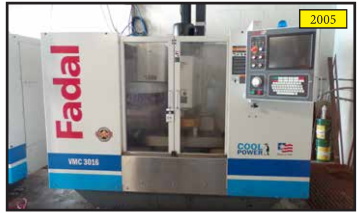
2005 Fadal VMC3016HT CNC Vertical Machining Center s/n 032005027396 w/ Fadal Multi Processor CNC Controls, 21-Station ATC, CAT-40 Taper Spindle, 10,000 RPM, High Torque Spindle Motor, AC Drives, 4 meg Memory Expansion, High Speed CPU, Rigid Tapping, Graphics