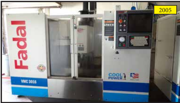
2005 Fadal VMC3016HT CNC Vertical Machining Center s/n 032005027397 w/ Fadal Multi Processor CNC Controls, 21-Station ATC, CAT-40 Taper Spindle, 10,000 RPM, High Torque Spindle Motor, AC Drives, 4 meg Memory Expansion, High Speed CPU, Rigid Tapping, Graphics