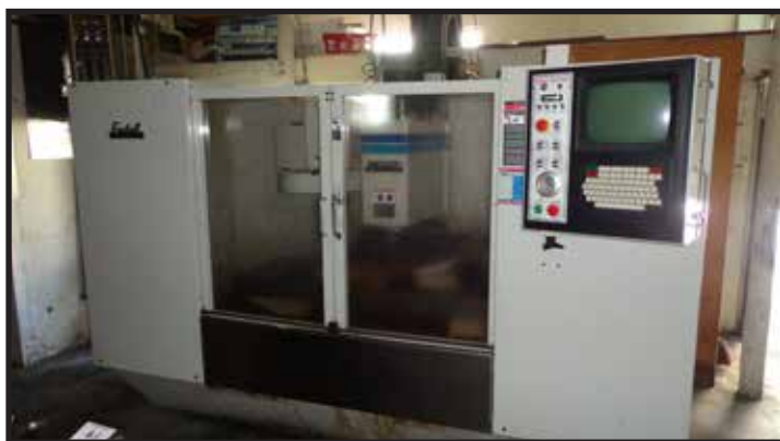
1994 Fadal VMC4020 mdl. 906-1 CNC Vertical Machining Center s/n 9401558 w/ Fadal CNC88HS Controls, 21-Station ATC, CAT-40 Taper Spindle, 7500 RPM, High Speed CPU, Graphics