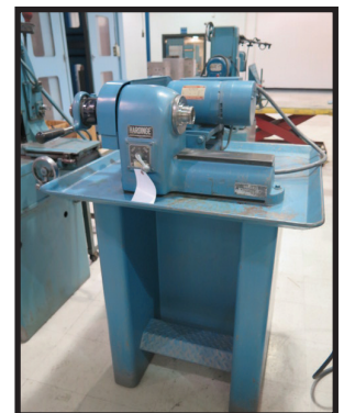
Hardinge HSL Speed Lathe