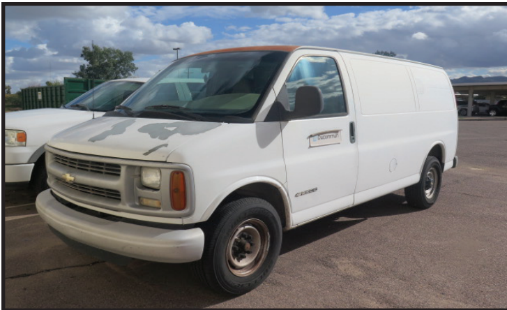
2000 Chevrolet 2500 Cargo Van

2007 Ford F-150 FX4 Off Road Dual Cab Pickup Truck Lisc CK81171 w/ 5.4L Triton Engine, Automatic Trans, AC, 161,862 Miles, VIN# 1FTPW14V47KC92923. 2000 Chevrolet 2500 Cargo Van Lisc CB43303 w/ Gas Engine, Automatic Trans, AC, 108,882 Miles, VIN#1GCGG25RXY1274826. Gorbel 2000 Lb Cap 4-Post Gantry System w/ Electric Hoist. Gorbel 1 Ton Cap. Floor Mounted Jib w/ Electric Hoist. 1000 Lb Cap Hydraulic Lift Cart. Hydraulic Lift Cart. Large Selection of Quality Office Furniture.