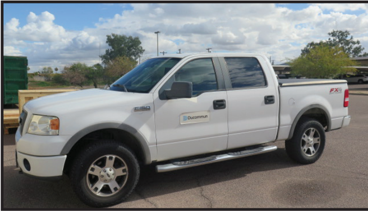
2007 Ford F-150 FX4 Off Road Dual Cab Pickup Truck