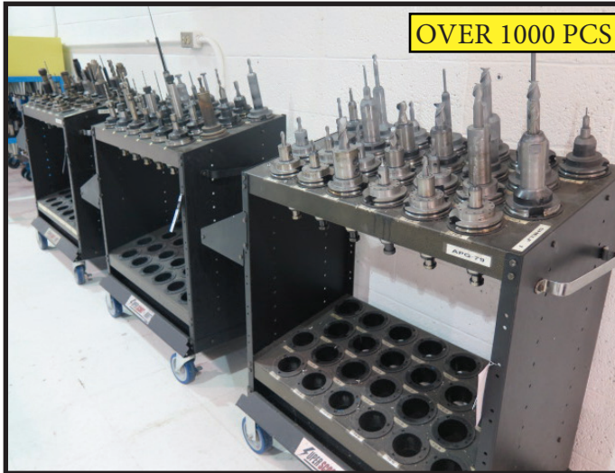
Partial View of CVAT-50 Taper Tooling **OVER 1000 PCS**