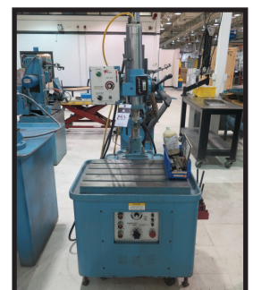
ElectroArc 2DBQT Metal Disintegrator