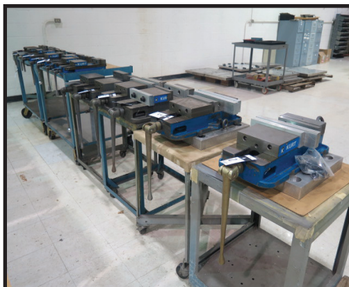
Kurt 6" and 8" Vises