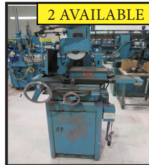
Boyar Schultz 6" x 12" Surface Grinder **2-AVAILABLE**