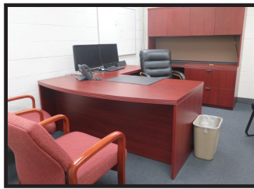
Partial View of Available Office Furniture