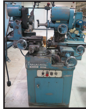
Cincinnati Milacron Monoset MT Tool and Cutter Grinder