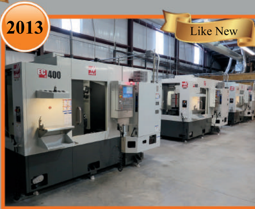
NOV 2013 Haas EC400 2-Pallet 4-Axis CNC Horizontal Machining Center S/N 2054226