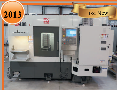
NOV 2013 Haas EC400 2-Pallet 4-Axis CNC Horizontal Machining Center S/N 2054228