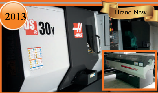
2013 Haas DS-30Y Twin Spindle Live Turret CNC Turning Center, S/N 3097354