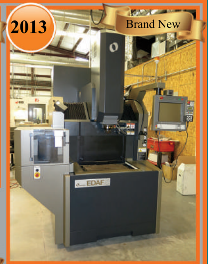
2013 Makino EDAF2 CNC Die Sinker EDM Machine S/N E70105