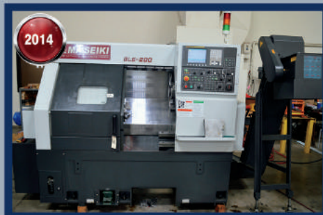
2014 Yama Seiki GLS-200, 4200 RPM, Chip Conveyor, Fanuc Oi-TD Control