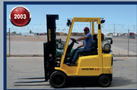
2003 Hyster Model S40XM Forklift, LP Style, New Battery Installed