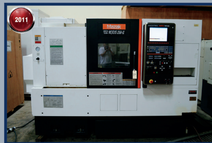
2011 Mazak QTN250-II, Chip Conveyor, Tool Presetter, Mazatrol Matrix Nexus Control

Lots Begin Closing: Thursday, July 26, 2018 10:00 AM (MST) Inspection/Preview: Wednesday, July 25, 2018 9:00 AM - 3:00 PM (MST) Inspection Location: 5707 W. Buckeye Rd., Bldg. B Phoenix AZ 85043