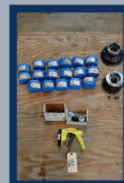
Full Royal Quick Change Dead Legnth Colet System

Complete Terms & Conditions are available online @ www.kdauctions.com