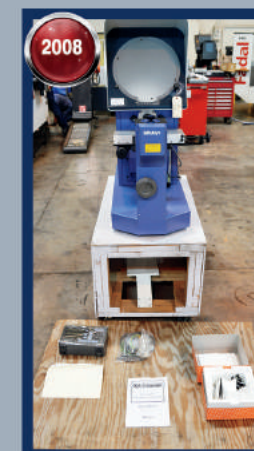
2008 Mitutoyo PH-A14 Profile Projector