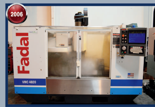
2006 Fadal VMC4020HT, Fadal Multi Processor CNC Control

Late Model Multi Axis Machines, Air Compressors, Saws, Lista Cabinets and Brand New Tooling! Mazak, Doosan, Fadal, Hydmech, Mitutoyo, Yama Seiki