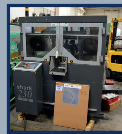
HydMech Shark 230NCHS Saw, Dual Column, Overhead Bundling