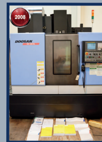
2008 Doosan MV3016L, Fanuc i Series Control