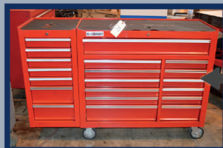
US General 72" x 22" Triple Bank Red Roller Cabinet containing High End Tooling and All Contents

This brochure is only a partial listing. Please visit www.kdauctions.com for a complete list and bid online