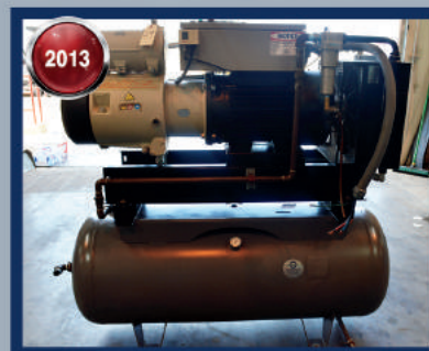
2013 Mattei Rotary Vane Air Compressor, 200 PSI, 120G Horizontal Tank