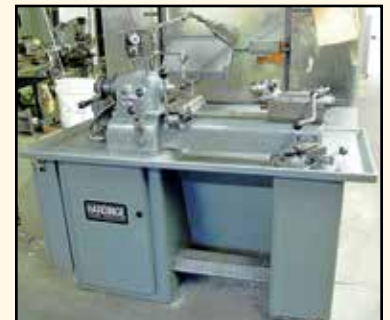
Hardinge DV-59 Turret Lathe

Kearny & Trecker Milwaukee #2K Plain Horizontal Mill , #50 taper, 15–1,500 RPM, 12" x 56" table, S/N: 60-3748