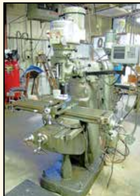
Bridgeport "Series I" Vari-Speed Vertical Mill

Bridgeport 1-1/2HP Vari-Speed Vertical Mill , 9" x 48" power feed table, 60–4,200 RPM, R8 spindle, Acu-Rite II digital readout, S/N: 12BR-56049; S/N: 12BR-113868