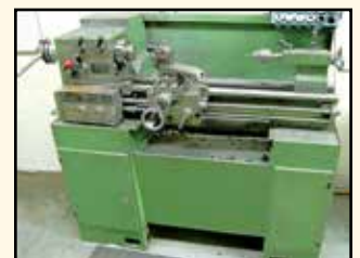
11" x 28" Emco "Maximat Super II" Lathe

ONLINE BIDDING ENDS: Wednesday January 13th, 2016 at 2:00 p.m.