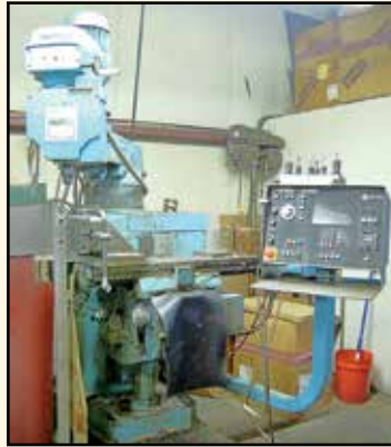
Hurco SM-1 Vertical Knee-Type CNC Mill