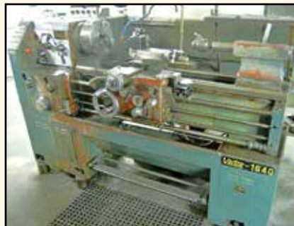
16" x 40" Victor "1640" Gap Bed Lathe