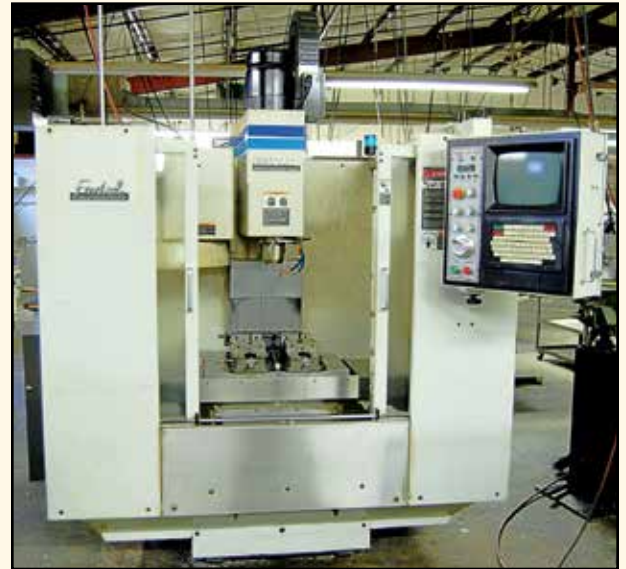
Fadal VMC 2016L Vertical Machining Center

Visit Our Website For Full Terms & Conditions, Additional Information at www.kosterindustries.com