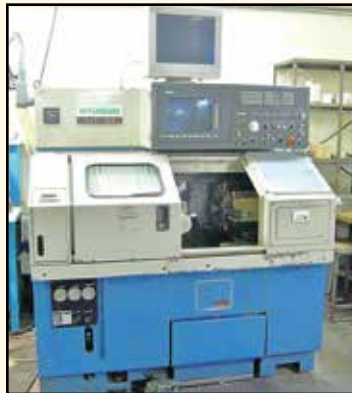
Hyundai Hit 8S CNC Lathe