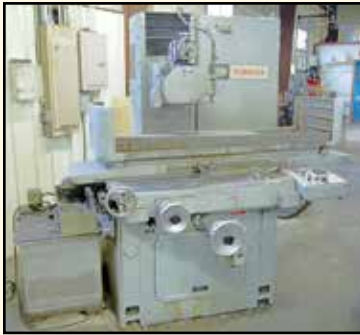
12" x 20" Blohm "Simplex 5" Hydraulic Surface Grinder