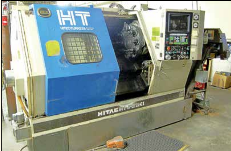
Mori-Seiki "Hitec Turn 25S" CNC Lathe