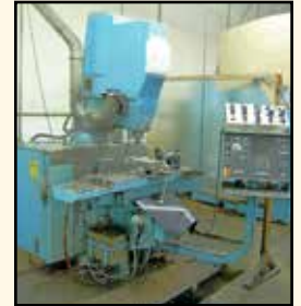
Hurco KMB-1 Vertical Knee-Type CNC Mill

Hyundai Hit 8S , 6" dia. 3-jaw chuck, 7.5HP, 8-position turret, tailstock, tool pre-setter, Siemens control, S/N: Hitrol 840C-08-569