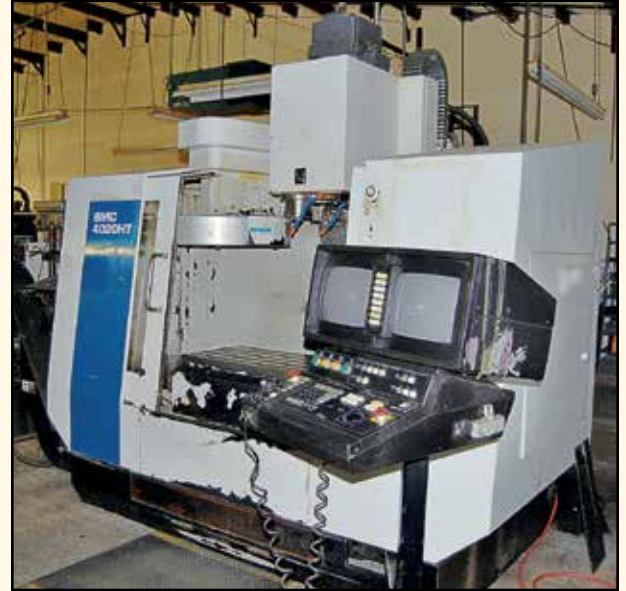
(1 of 2) Hurco BMC-4020 HT/M Vertical Machining Center