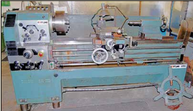
20" x 60" Fortune Mdl. S2060 Gap Bed Lathe