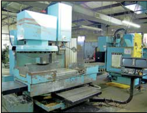
(1 of 2) Hurco BMC-40 Vertical Machining Centers