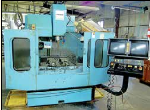
(1 of 2) Hurco BMC-20 Vertical Machining Centers